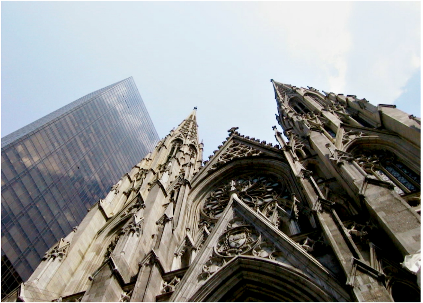
St. Patrick's Cathedral in Manhattan, New York

The New York Archdiocese discovers there's gold in those Manhattan skyscraper canyons. It is looking to sell the air rights to its valued midtown properties. Meanwhile, on the ground, Dorothy Day's parish church and other now-shuttered properties are up for sale .