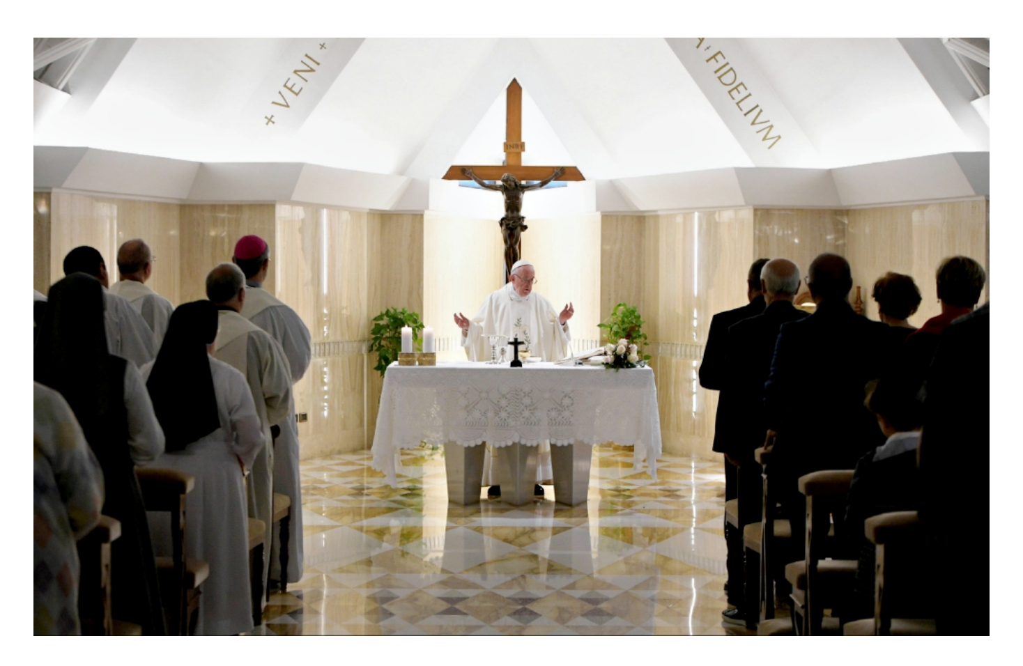
Pope Francis celebrates Mass Sept. 18 in the chapel of Casa Santa Marta at the Vatican.

According to the council, the church should cultivate and foster "the qualities and talents of the various races and nations" ( Sacrosanctum Concilium 37). Local churches, the council encouraged, should be willing to "borrow from the customs, traditions, wisdom, teaching, arts and sciences of their people" ( Ad Gentes 22). This could include the incorporation into the liturgy itself, when possible, of certain elements drawn from local cultures.