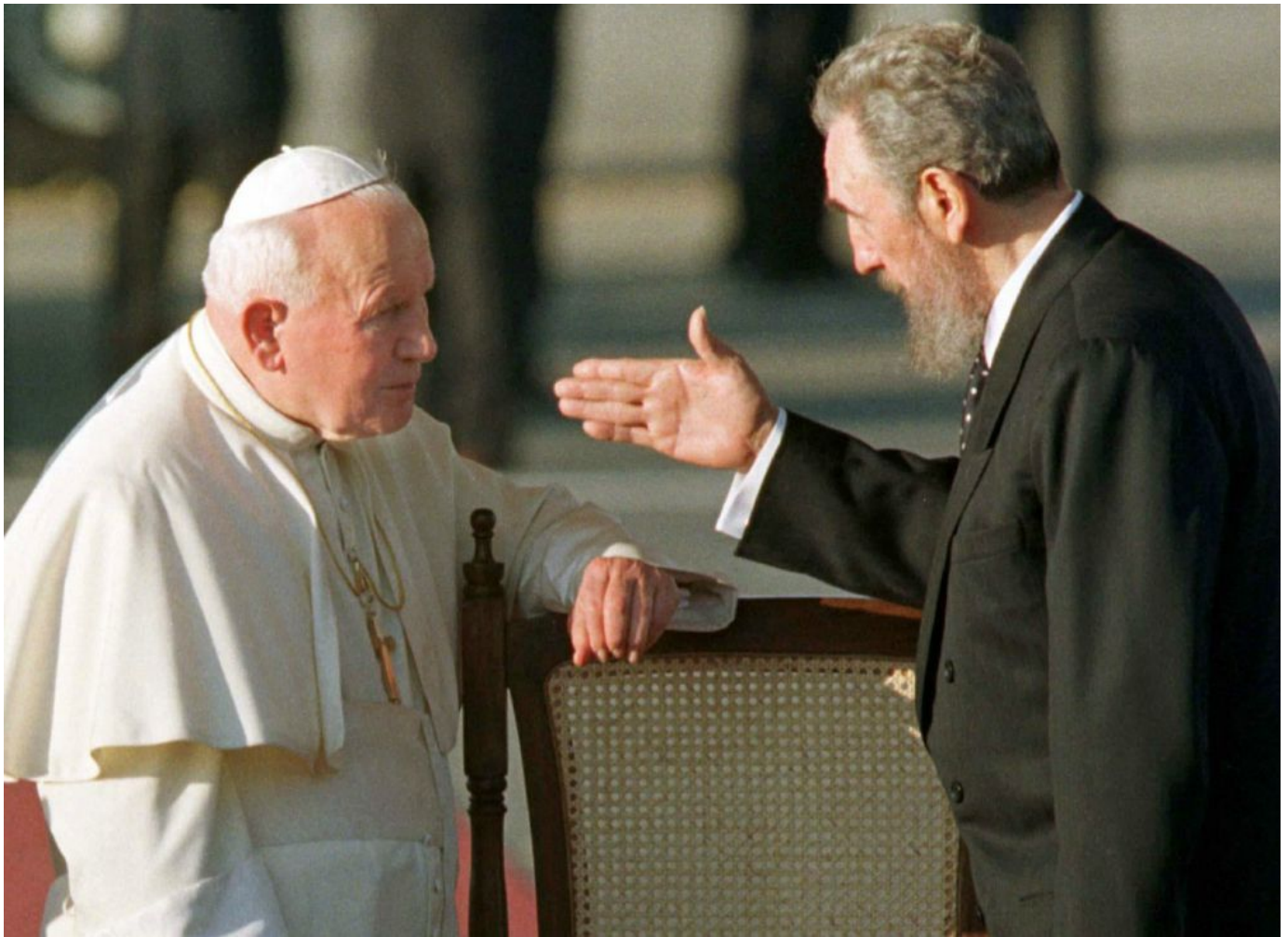
Cuban President Fidel Castro gestures to Pope John Paul II during the pope's arrival ceremony at Jose Marti Airport in Havana Jan. 21, 1998.

Propaganda? Fake news? Or simply a commentary penned by Ernesto Che Guevara that greatly influenced Fidel Castro during his student days at the Jesuit Colegio de Dolores where he read it. Fidel and his brothers, Ramón and Raúl, came as boarders to Dolores in Santiago de Cuba after studying briefly with the Christian Brothers who ran LaSalle, also in Santiago, Cuba's second largest city.