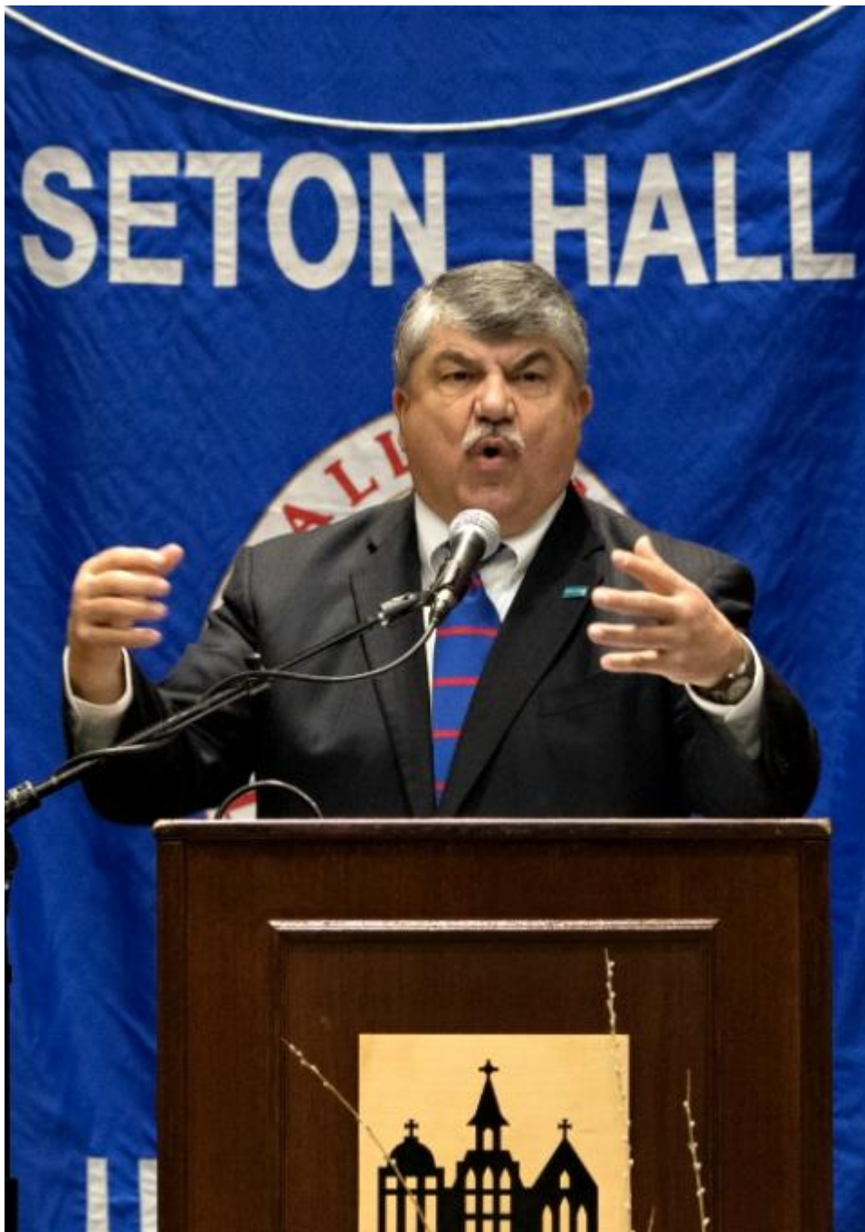
Richard Trumka speaks about Pope Francis March 6 at Seton Hall University in South Orange, New Jersey.

All three speakers at the March 6 event — Trumka, Cardinal Joseph Tobin of Newark, New Jersey, and New Jersey Gov. Phil Murphy — were repeatedly interrupted by applause as they quoted different statements our Holy Father has made. Among the seasoned church-watchers in the press corps, there was widespread agreement that Trumka understands Francis better than half the bishops and many theologians.