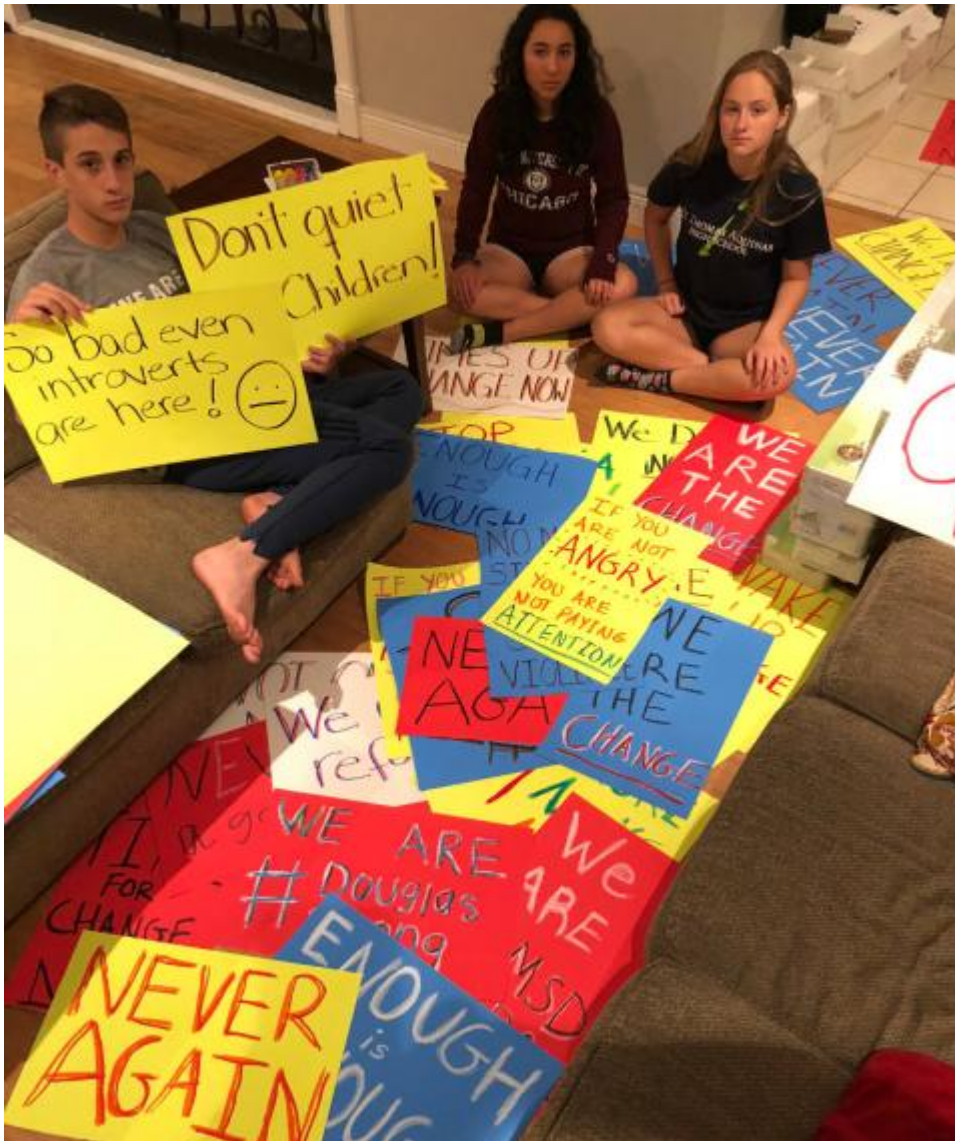
Aquinas students make posters the night before the March for Our Lives in Parkland, Florida.

At the rally that preceded the march, students and parents spoke about their own experiences since the shooting in their community, and called those in attendance to take action to bring about change in the government. One proposed idea asked parents, grandparents and even people without children to sign a contract pledging to vote on behalf of children for candidates who will protect children in schools.