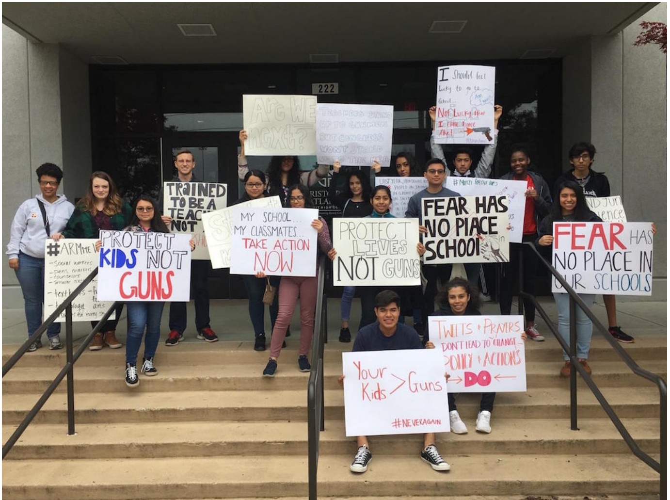
Students at Cristo Rey Atlanta Jesuit High School show the posters they made for March for Our Lives.

On Saturday, they carried their signs again among an estimated 30,000 people through downtown Atlanta. The route took the marchers from the Center of Civil and Human Rights to Liberty Plaza near the state capitol building. U.S. Rep. John Lewis, who had marched with Martin Luther King Jr. in Selma, Alabama, in 1965 was among the day's speakers.