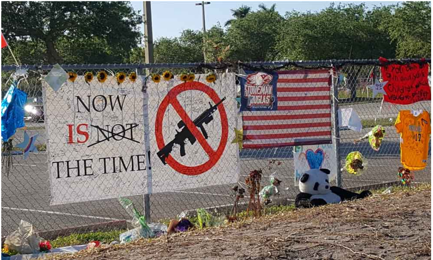
Memorial outside Marjory Stoneman Douglas High School, March 9, in Parkland, Florida