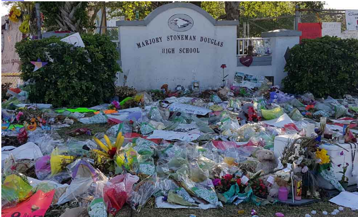
Memorial outside Marjory Stoneman Douglas High School, March 9, in Parkland, Florida