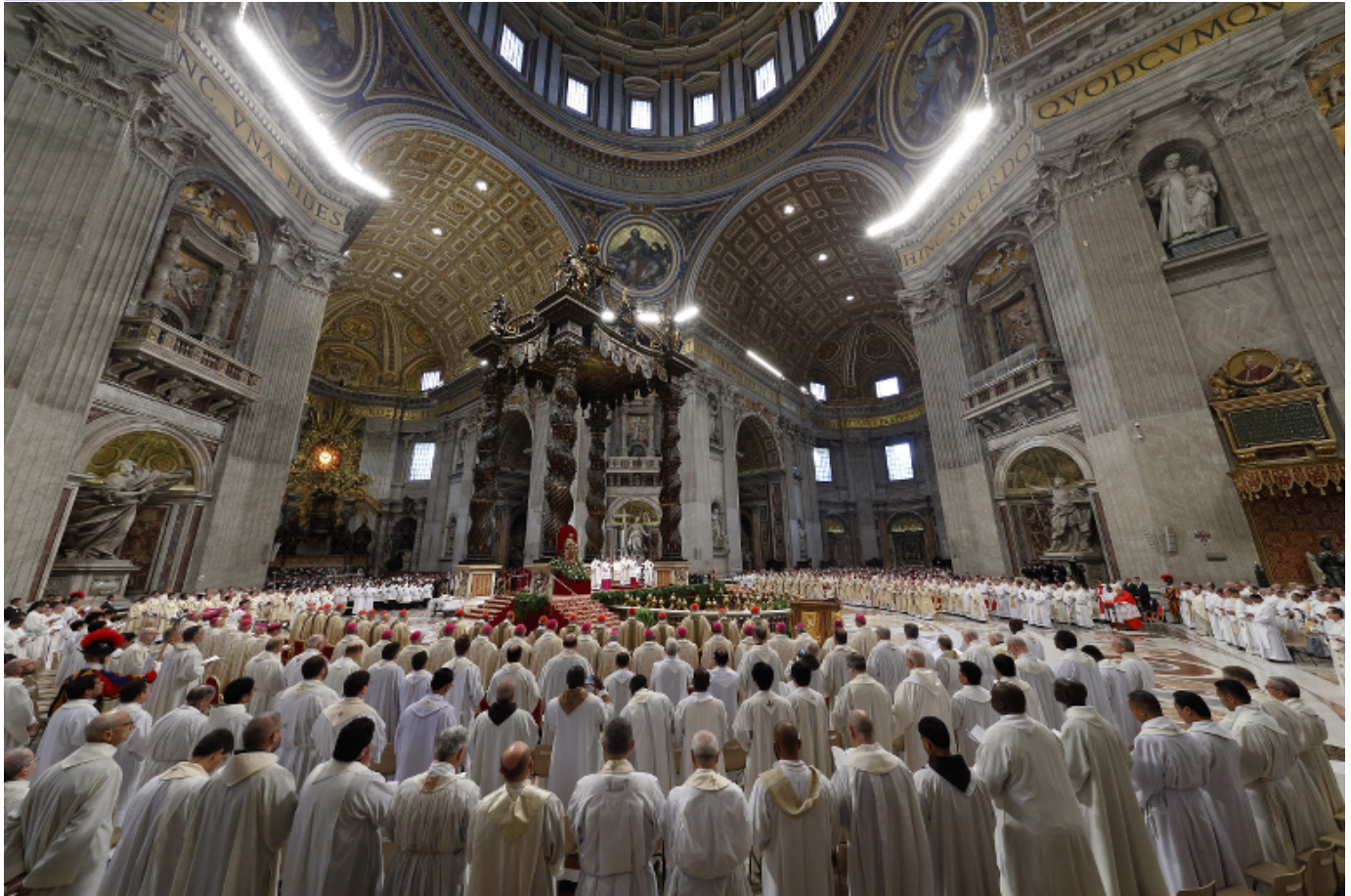
Pope Francis celebrates Holy Thursday chrism Mass in St. Peter's Basilica at the Vatican March 29.