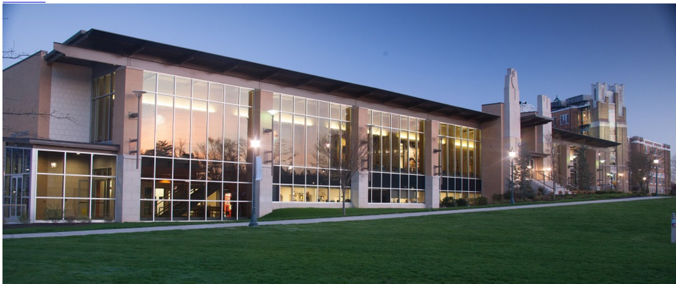
Sandy and Marlene Insalaco Hall on the campus of Misericordia University in Dallas, Pennsylvania