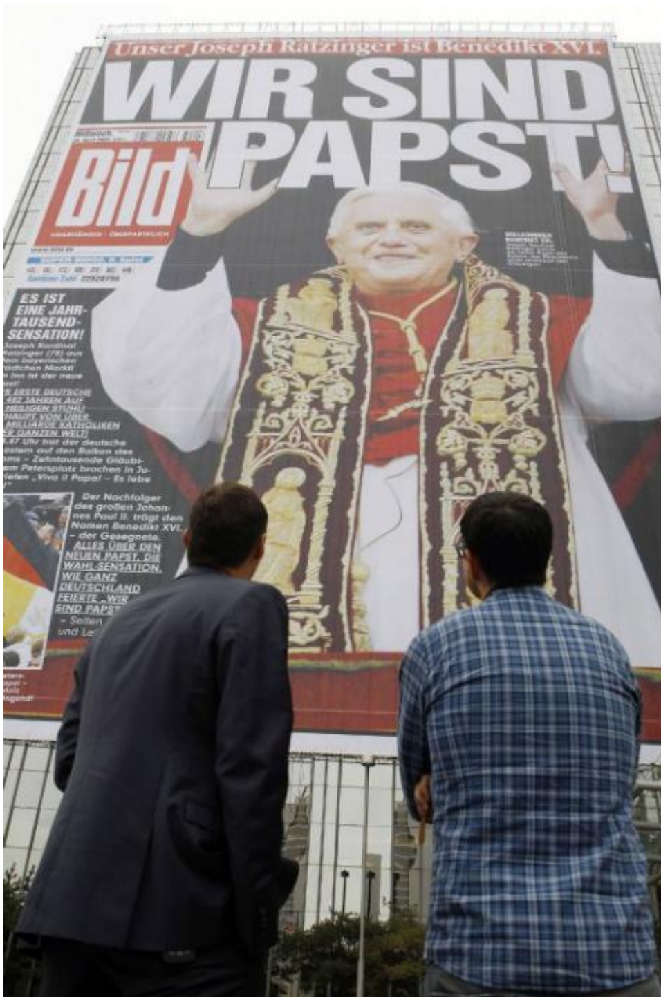
Men look at a giant blow-up of a front page of the German Bild newspaper from April 5, 2005, in Berlin Sept. 19, 2005. The paper features a front-page story about the election of German Cardinal Joseph Ratzinger to be Pope Benedict XVI and reads "We Are Pope."