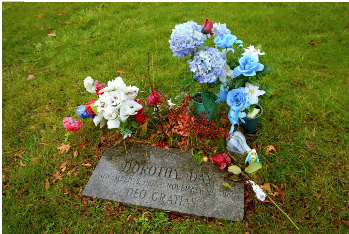
The grave of Dorothy Day at Cemetery of the Resurrection in the Staten Island borough of New York, pictured Dec. 9, 2012