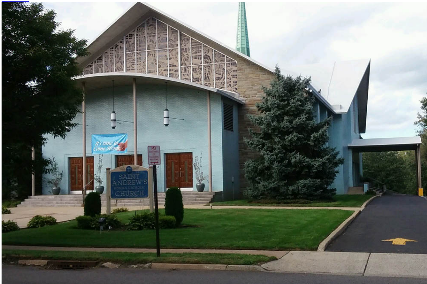
St. Andrew's Church in Westwood, New Jersey