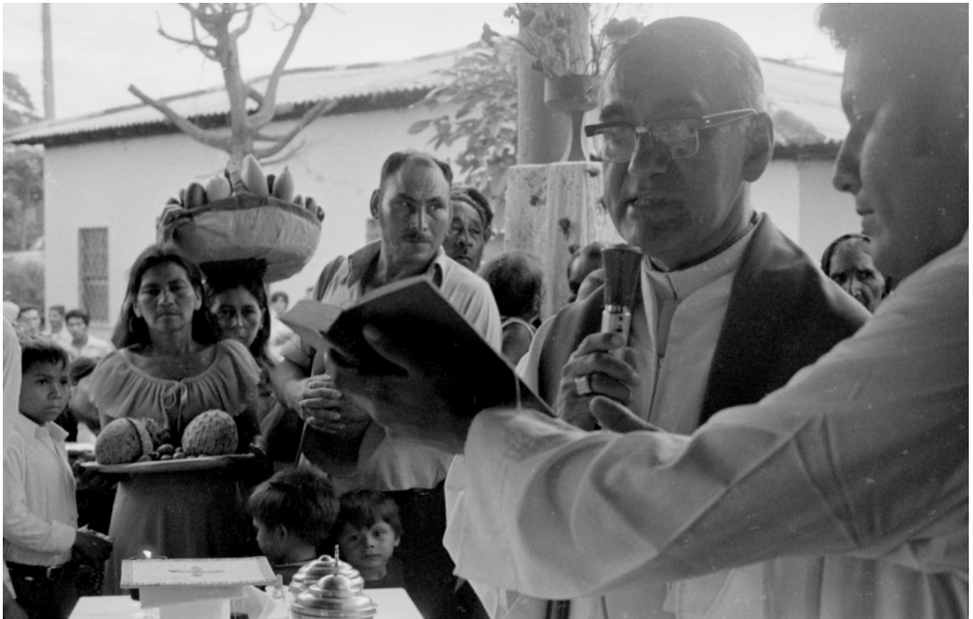
Archbishop Óscar Romero presides at a confirmation Mass in Ateos in San Salvador, El Salvador, September 1979.

Nor did Francis stop there; he did something else that had long cried out to be done. Many people aren't aware — but Francis was — of how shabbily Romero was treated by all but one of his brother bishops. Seldom has there been a condemnation of bishops as strong as the one Francis expressed to a group of Salvadoran pilgrims who were visiting the Vatican in 2015: