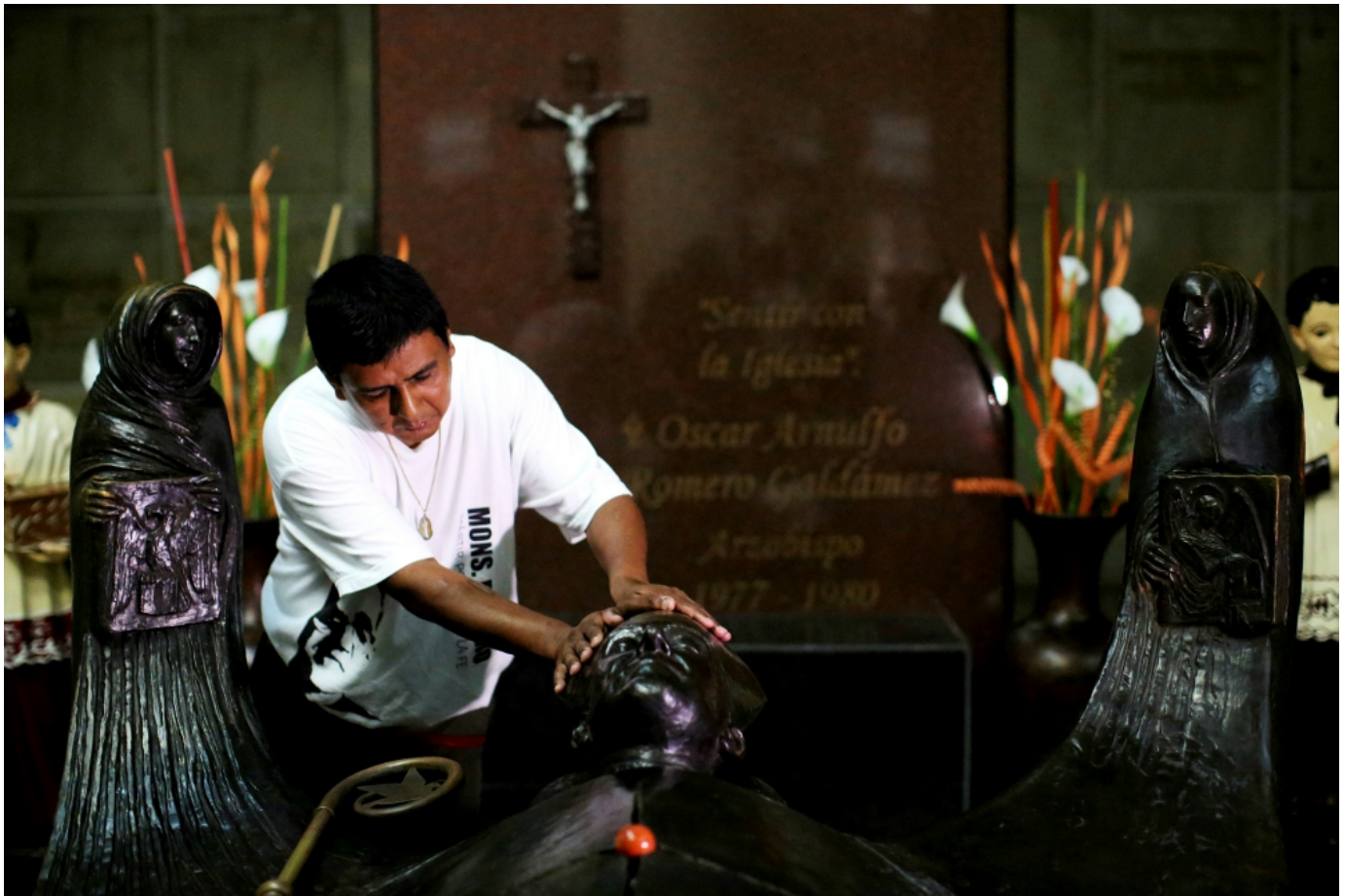
A man prays at the grave of Blessed Oscar Romero in 2017 at the Metropolitan Cathedral in San Salvador, El Salvador.