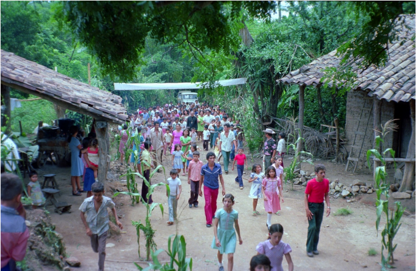
A crowd of people from San Antonio Los Ranchos in Chalatenango, El Salvador, walk with Archbishop Óscar Romero as he arrives to celebrate Mass in 1979.

I came from. I started creating another world. When I went back to El Salvador, they made me the bishop's secretary in San Miguel. I was a parish priest there for 23 years, but I was still buried in paperwork ... Then they sent me to Santiago de María, and I ran into extreme poverty again. Those children that were dying just because of the water they were drinking, those campesinos killing themselves in the harvests ... You know, Father, when a piece of charcoal has already been lit once, you don't have to blow on it much to get it to flame up again ... So yes, I changed. But I also came back home again."