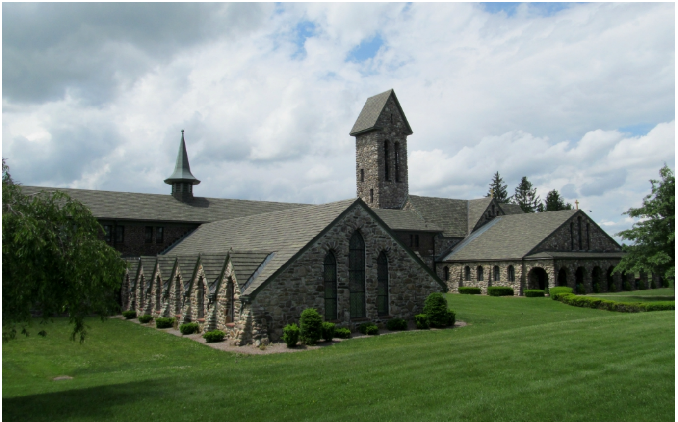
St. Joseph's Abbey in Spencer, Massachusetts