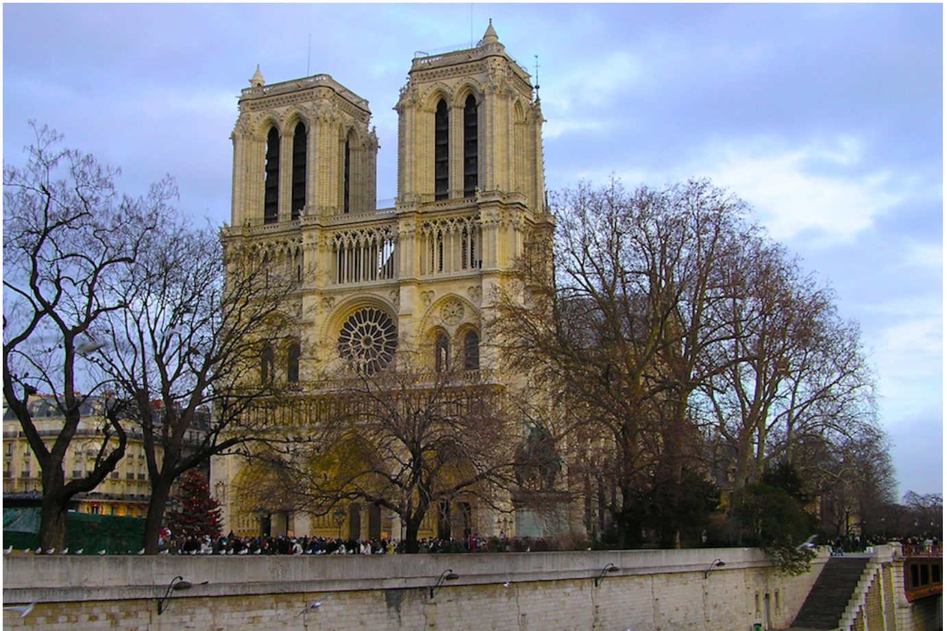
Notre-Dame Cathedral, built 1163-1250, Paris, France

I'm penning this article at a time that Jews throughout the world are still reeling from the shooting at a synagogue in Pittsburgh, where worshipers were killed for simply being Jews. That's been a recurring trope throughout Jewish history, and I'm aware that Christians, often in the name of their faith, have killed far too many Jews to count. That includes Hitler, although of course his views on religion weren't straightforward by any means. The question that many people within the community in which I grew up often ask themselves is whether to parse certain Christians from their faith's real mission or whether there is something rotten at the core of Christianity that birthed the Crusades, Inquisition, countless pogroms and blood libels, and the Holocaust.