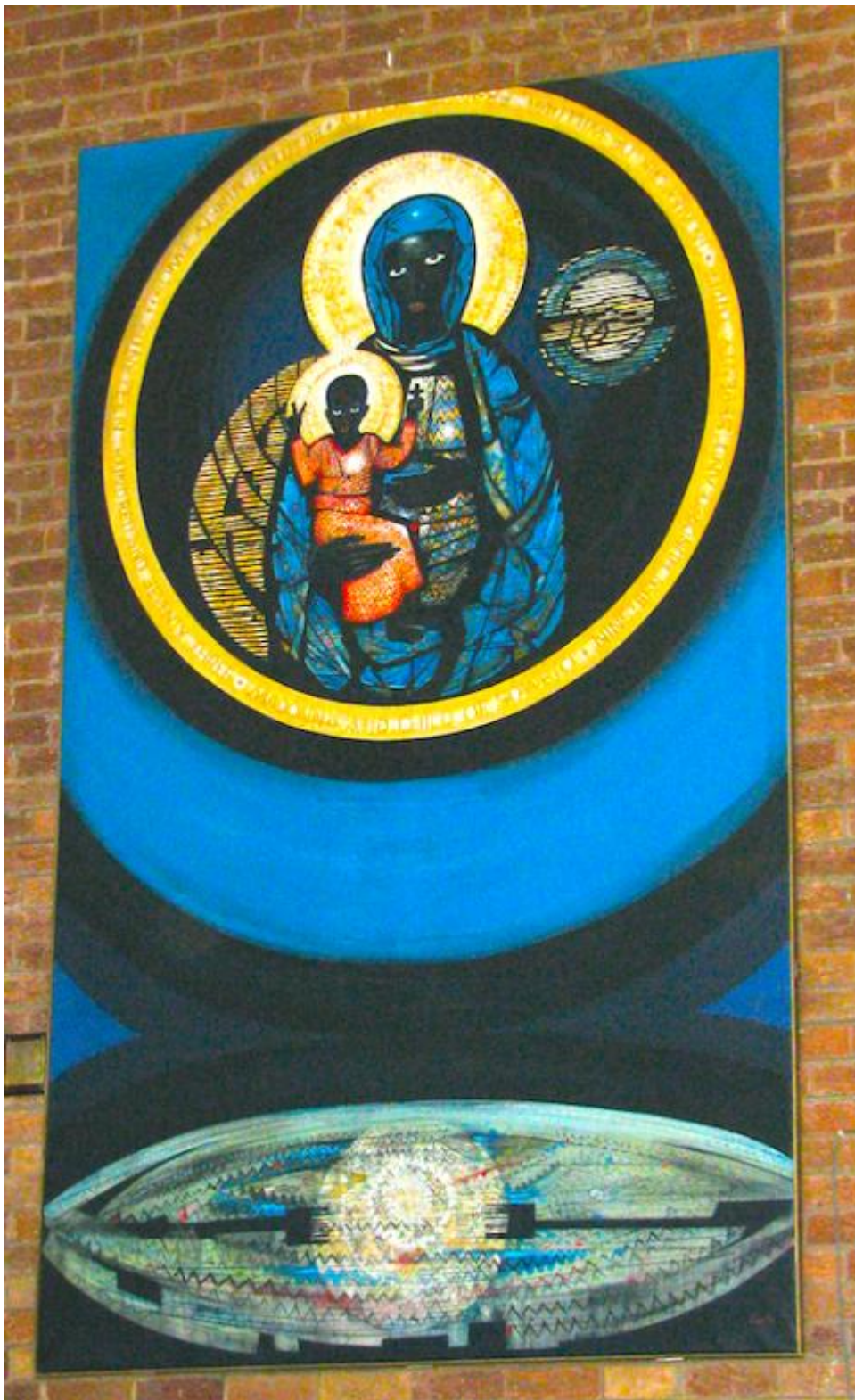
"The Madonna and Child of Soweto" at Regina Mundi Church in Johannesburg, South Africa