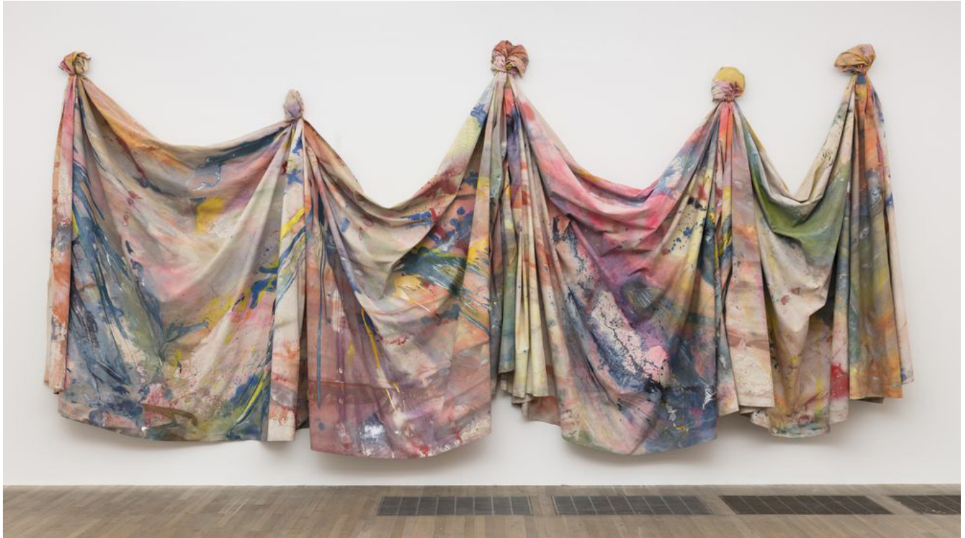
Sam Gilliam, "Carousel Change," by Sam Gilliam, 1970, from Tate Museum, courtesy of the artist and David Kordansky Gallery, Los Angeles, California; © Sam Gilliam

Bowling's expansive abstract landscapes in acrylic that faintly reveal stencils of continents formerly laid beneath them. And William T. Williams' homage to John Coltrane, "Trane" (1969), a terrific, slashing spectrum of diagonal bands of color intersecting and overlaying each other and loosely organized around an irregular rectangle angled at 45 degrees in the center of the painting.