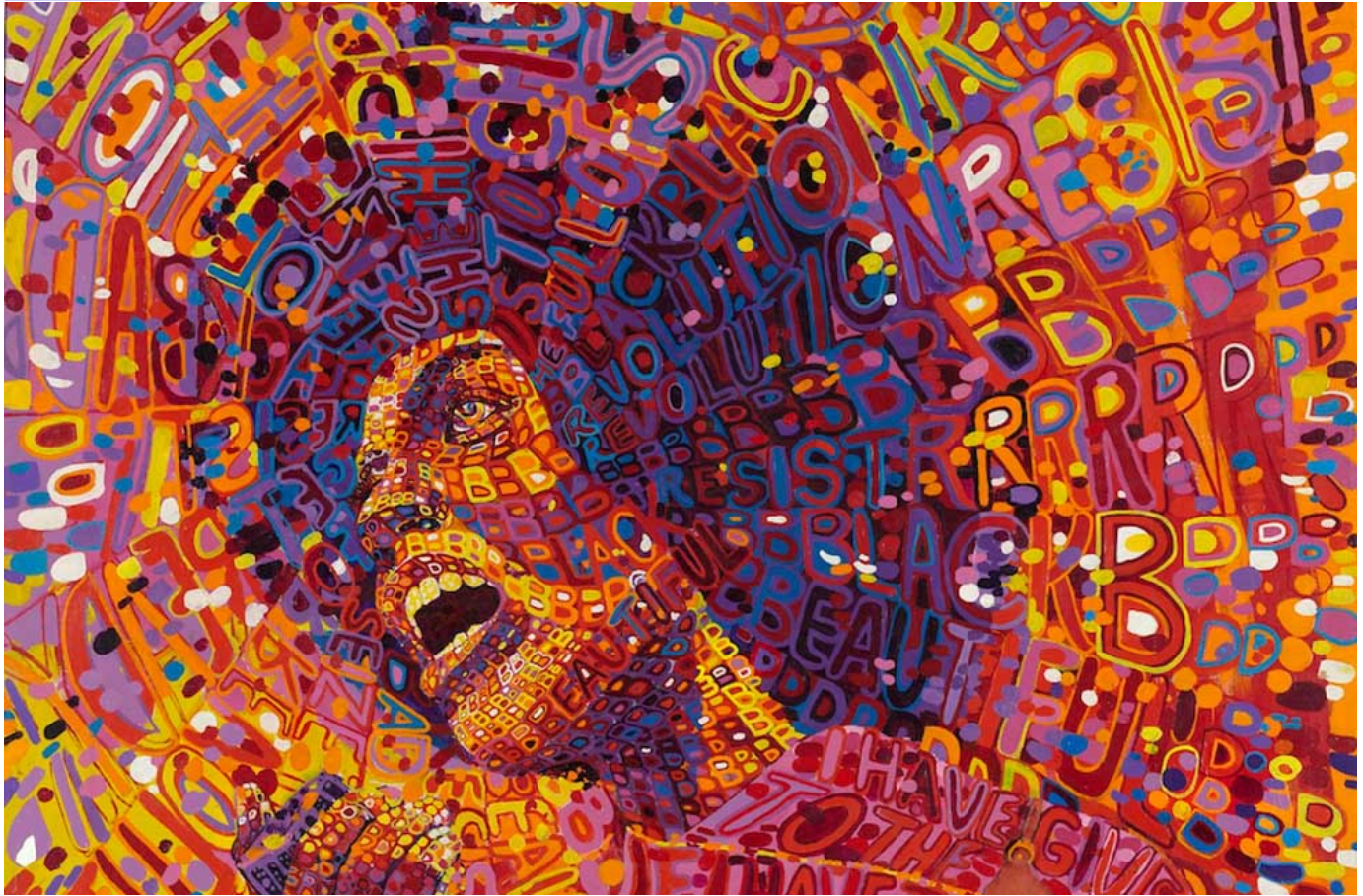
"Revolutionary (Angela Davis)" by Wadsworth Jarrell, 1971. © Wadsworth A. Jarrell.