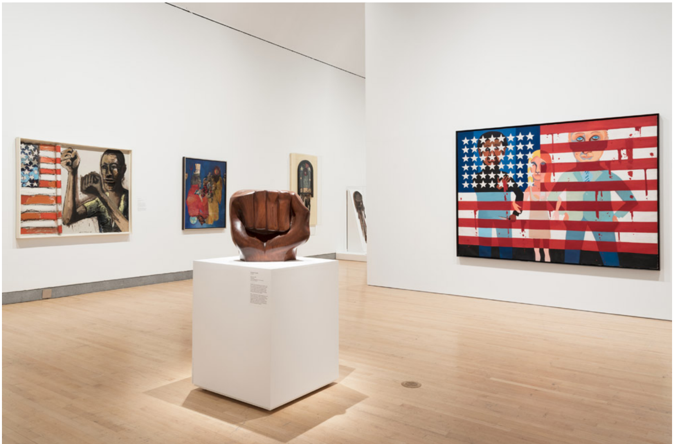
An installation at "Soul of a Nation: Art in the Age of Black Power," running Sept. 14, 2018 through Feb. 3, 2019, at the Brooklyn Museum in New York; from left: "Did the

The gallery recalling this scene — in New York especially — is centered on Elizabeth Catlett's gleaming Mahogany sculpture "Black Unity" (1968), with a raised fist on one side and portraits of a black man and woman on the other. Directly behind it is Faith Ringgold's "The Flag Is Bleeding" (1967), from her "super-realist" American People Series. In Benny Andrews' "Did the Bear Sit Under a Tree?" (1969), fist and flag figure together as a man with a zipper for a mouth shakes his fist at a flag made from rolled-up fabric. Another all but heartbreaking painting is nearby, Archibald Motley's "The First One Hundred Years: He Amongst You Who is Without Sin Shall Cast the First Stone: Forgive Them Father For They Know Not What They Do." The medley of dark images includes the crucifixion, Ku Klux Klan crosses, Satan and the dove of peace side by side, and more; the artist worked on the painting for nine years, and then never painted again.