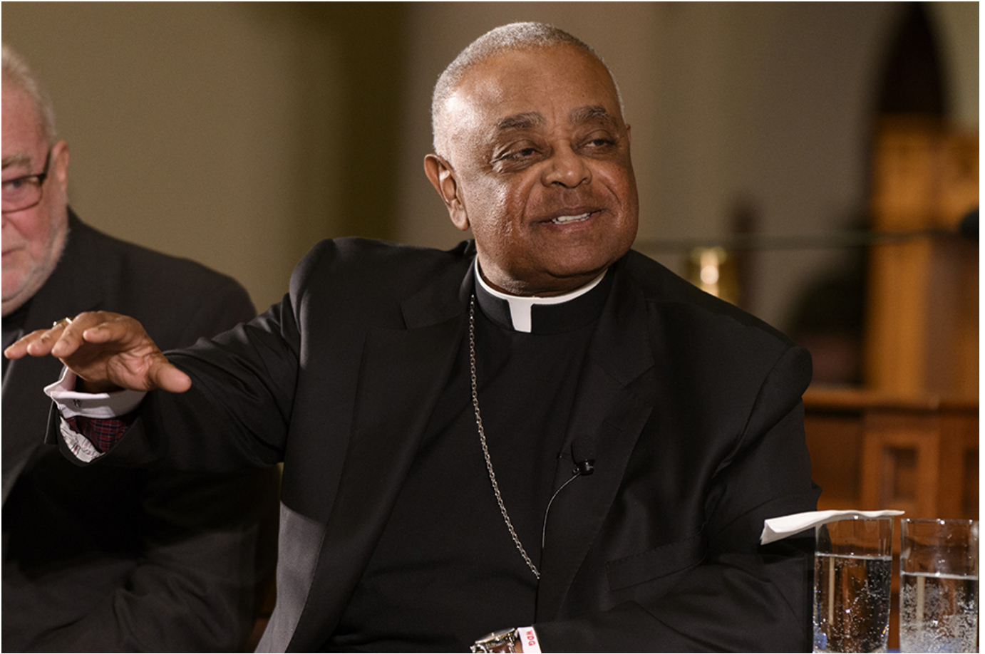
Atlanta Archbishop Wilton Gregory gestures during a panel titled "Confronting Racism in Our Hearts and in Our Nation" Nov. 13, 2017, at Georgetown University in Washington.