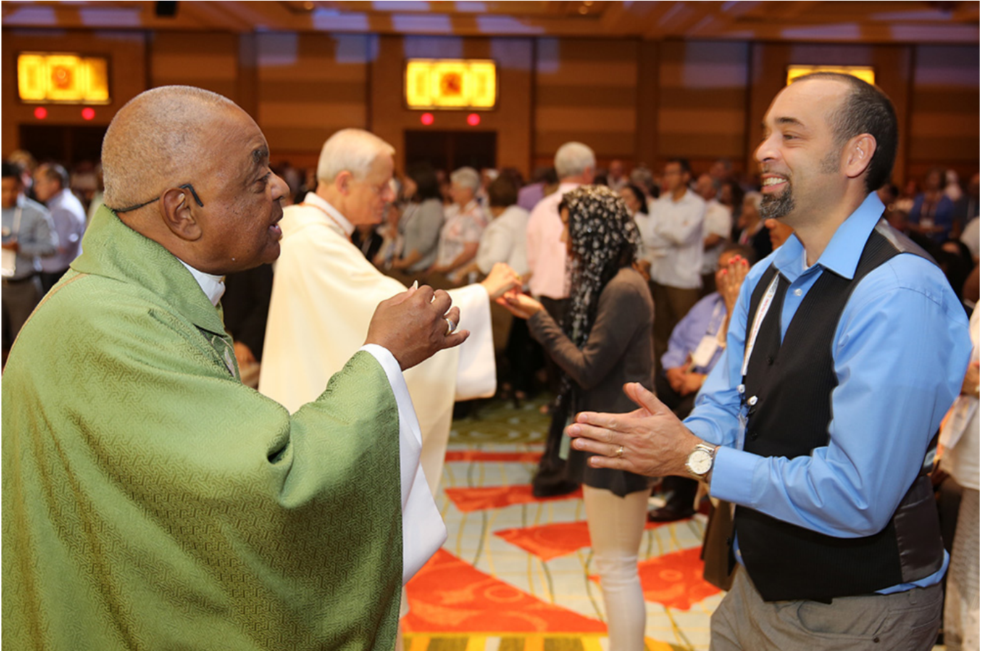
Atlanta Archbishop Wilton Gregory distributes Communion during Mass at the "Convocation of Catholic Leaders: The Joy of the Gospel in America" July 2, 2017, in Orlando, Florida.

The last archbishop, Cardinal Donald Wuerl, resigned in October after a Pennsylvania grand jury report sparked outcry over his handling of abusive priests in the early 1990s. His predecessor, Theodore McCarrick, has been revealed as a serial sexual harasser and resigned from the church's prestigious College of Cardinals last July before being dismissed from the clergy altogether by Francis in February.