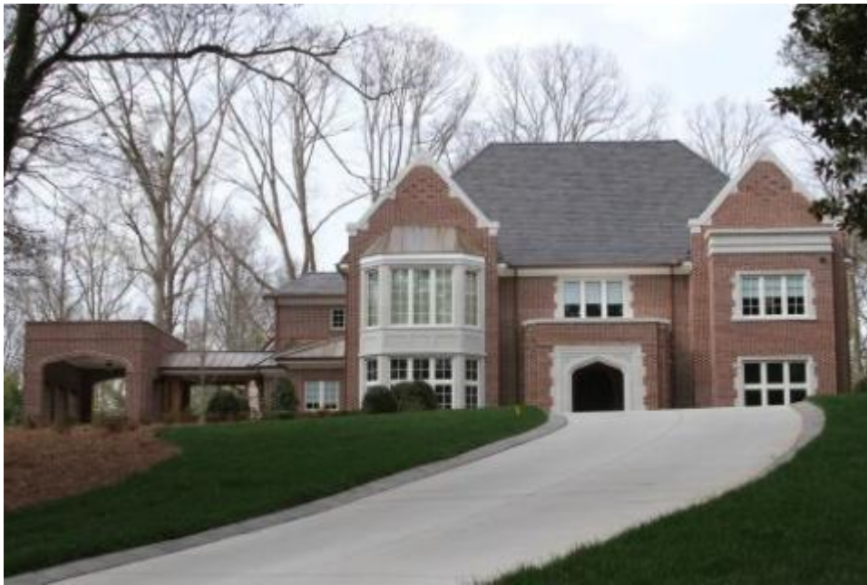
Atlanta Archbishop Wilton Gregory's residence pictured March 15, 2014

According to the Vatican's 2019 Annuario Pontificio , the official directory of the global church, the Washington Archdiocese contains some 2.3 million people, 659,000 of whom are Catholic.