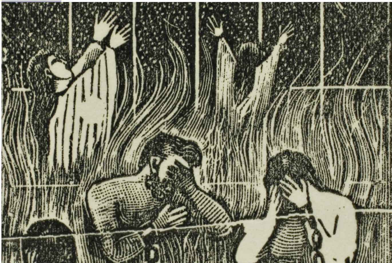
"Souls in Purgatory," detail, by José Guadalupe Posada, Mexican, 1871-1913 (Art Institute of Chicago)