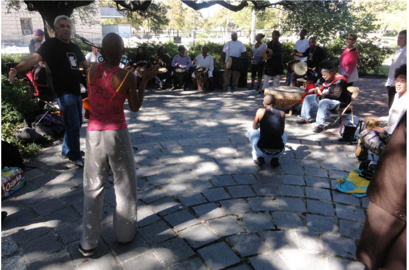
People drum and dance in Congo Square, New Orleans, October 2011.