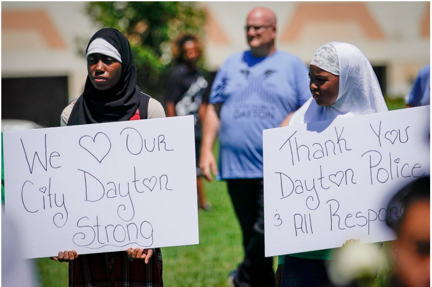
People take part in a vigil in Dayton, Ohio, Aug. 4.

"I think it's something we want to do something about, but it's so much easier to come together when something terrible happens," she noted.