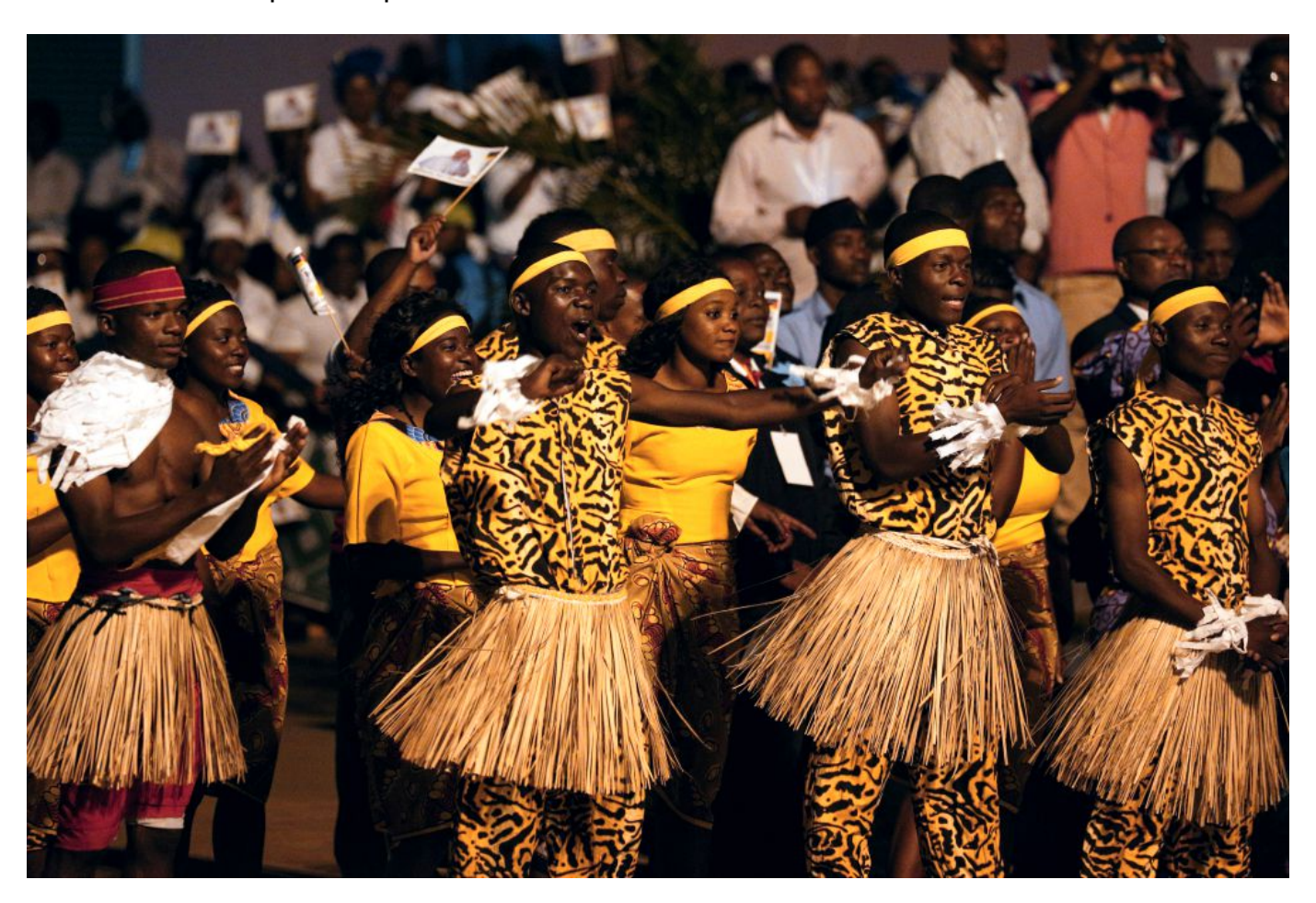
People cheer as Pope Francis arrives at the airport in Maputo, Mozambique, Sept. 4.

Mozambican Catholics, who represent about 25 percent of the country's population of about 27 million, expressed hope that Francis' words would help the nation continue on the path of peace.