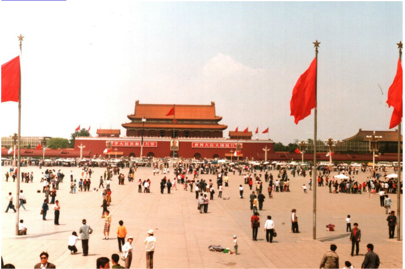
Tiananmen Square, Beijing, China, May 1988