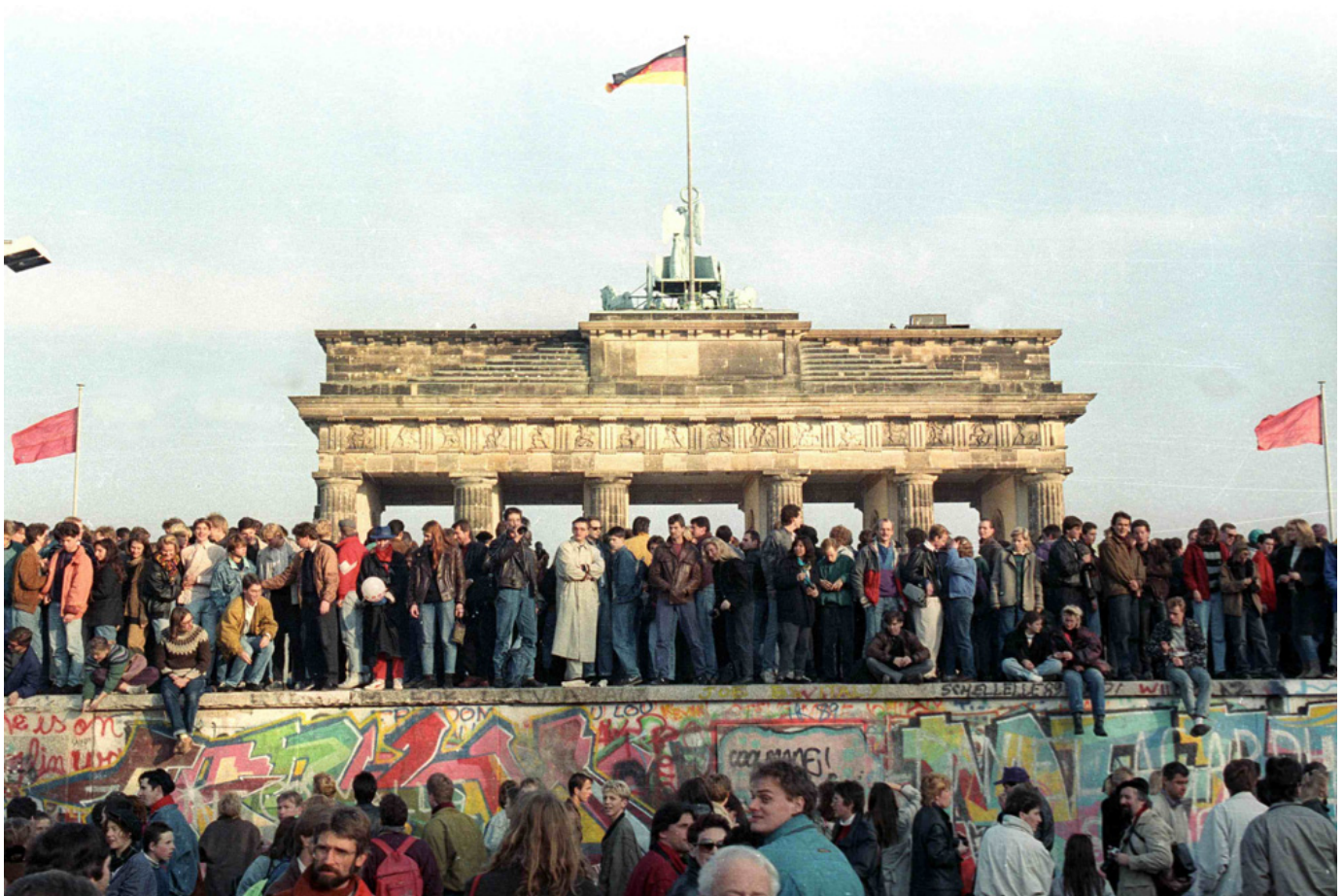
People stand atop the Berlin Wall in front of the Brandenburg Gate in this Nov. 10, 1989, file photo.

For Czechs, Slovaks and Romanians, it took the form of sudden uprisings in November and December 1989 — one peaceful, the other violent — and for East Germans the televised opening of the Berlin Wall on Nov. 9, 1989, graphically captured the revolutionary moment.