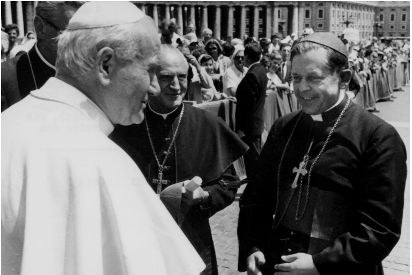
Pope John Paul II is pictured in a 1983 photo greeting Polish Cardinal Jozef Glemp of Warsaw.

The church has had to contend with its own problems. Hopes of a mass religious revival, high in the first years after communist rule, faded as consumer lifestyles diluted popular enthusiasm.