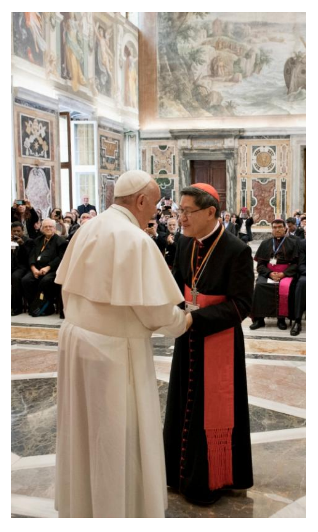
Philippine Cardinal Luis Antonio Tagle greets Pope Francis April 26, 2019, at the Vatican. In December, Francis named Tagle prefect of the Congregation for the Evangelization of Peoples.