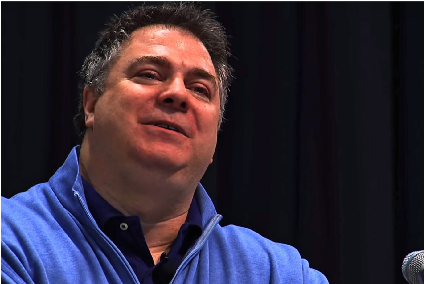
Screenshot of video featuring Matthew Kelly speaking at the Man Up Philly conference, March 2019 in Aston, Pennsylvania

Kelly's public life makes him an "easy target" for judgement. But there's a private side as well, and he said that he drives a luxury car because his mother made him promise to drive the safest car he could afford after his oldest brother died in a car accident.