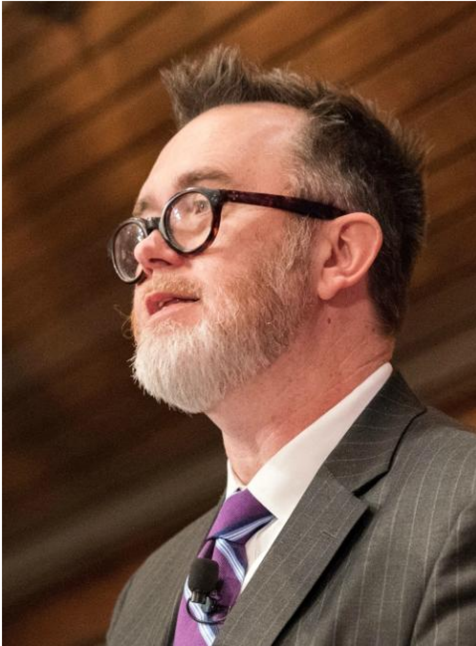
Rod Dreher in a 2017 file photo

Opening the event, U.S. author Rod Dreher warned that survivors of Europe's former communist regimes were "trying to sound the alarm" about the rise of a "pink police state."