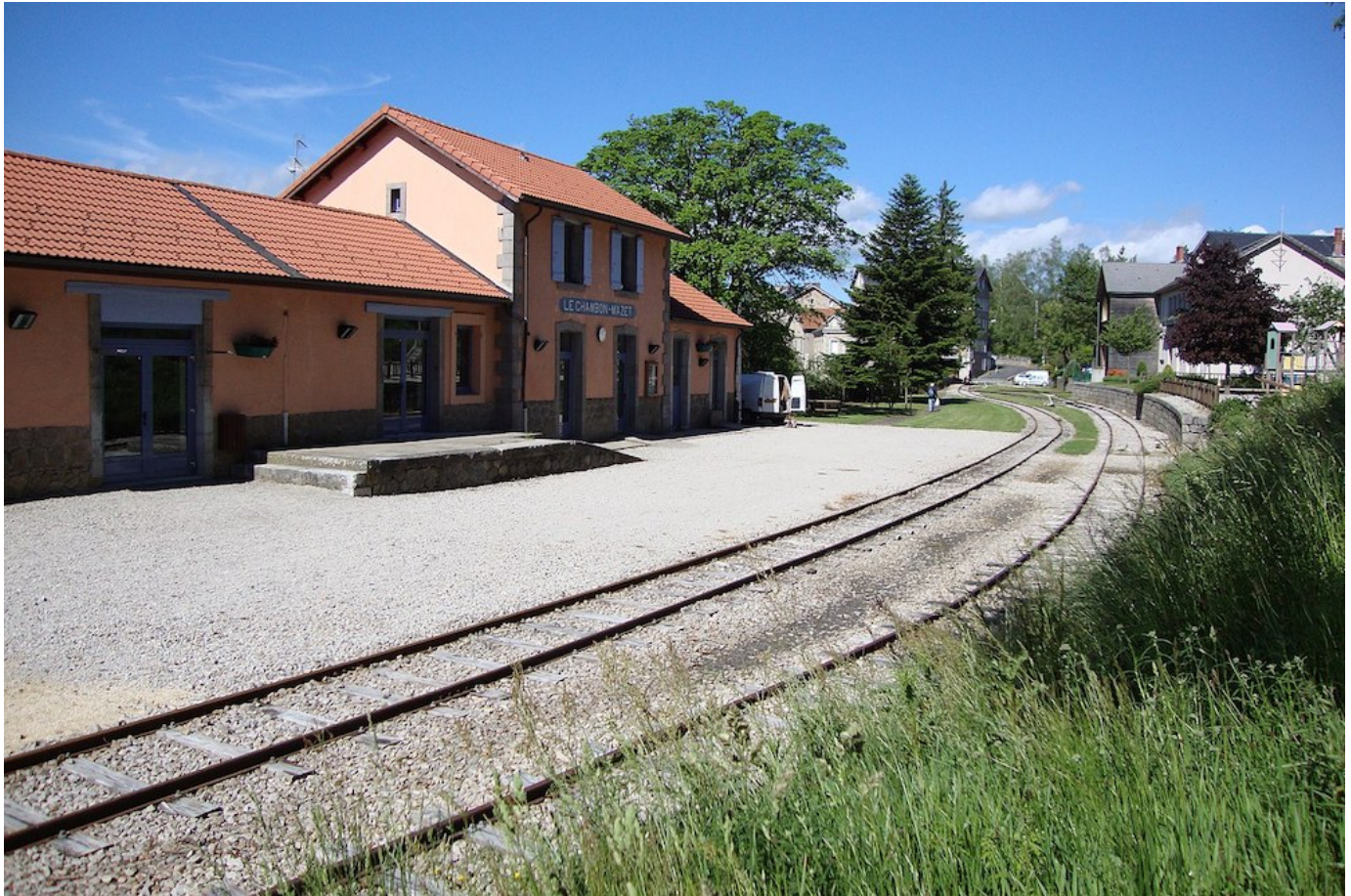
Train station of Le Chambon-sur-Lignon, a village on the Vivarais Plateau, France