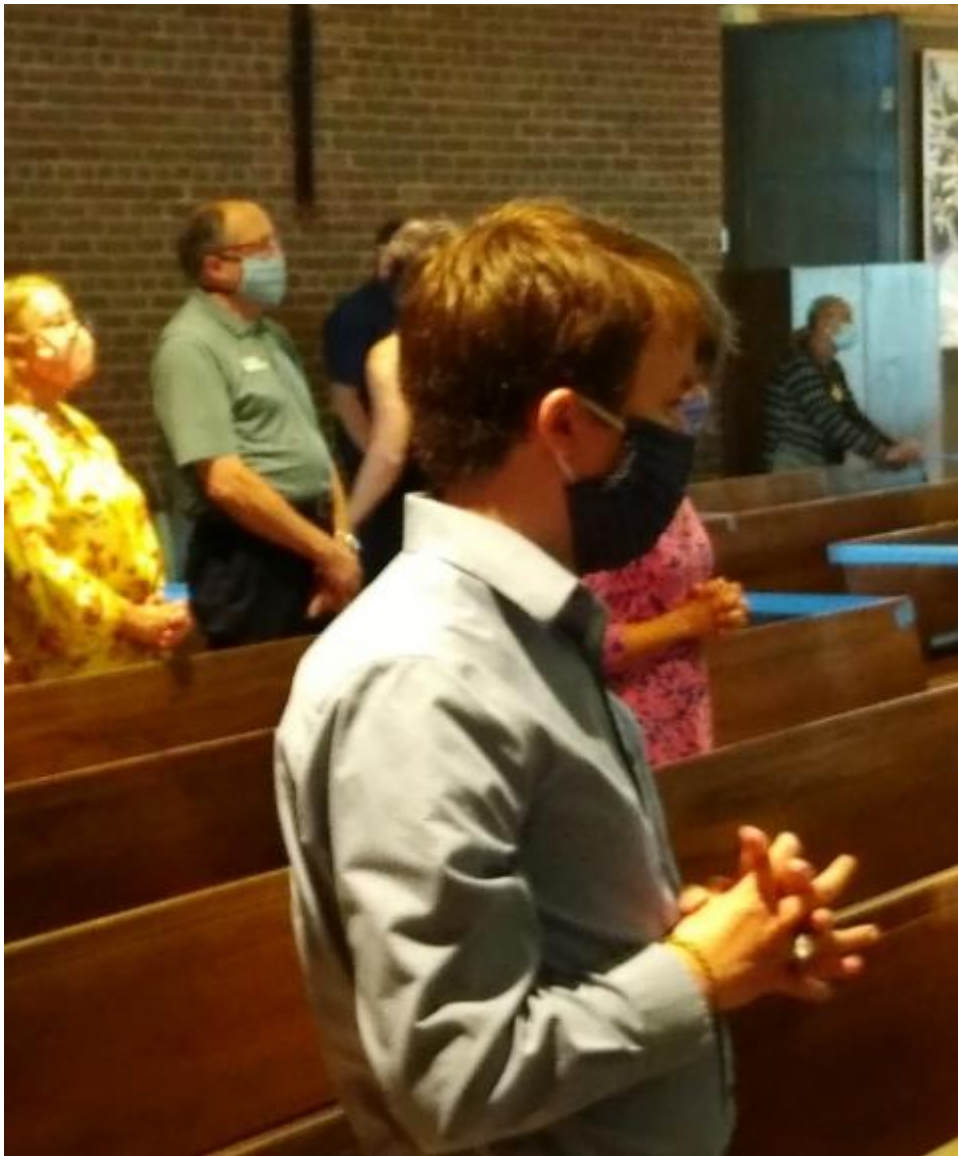
A young worshipper at St. John Fisher on a recent Sunday. The church serves as the Newman Center for students from nearby Oakland University.