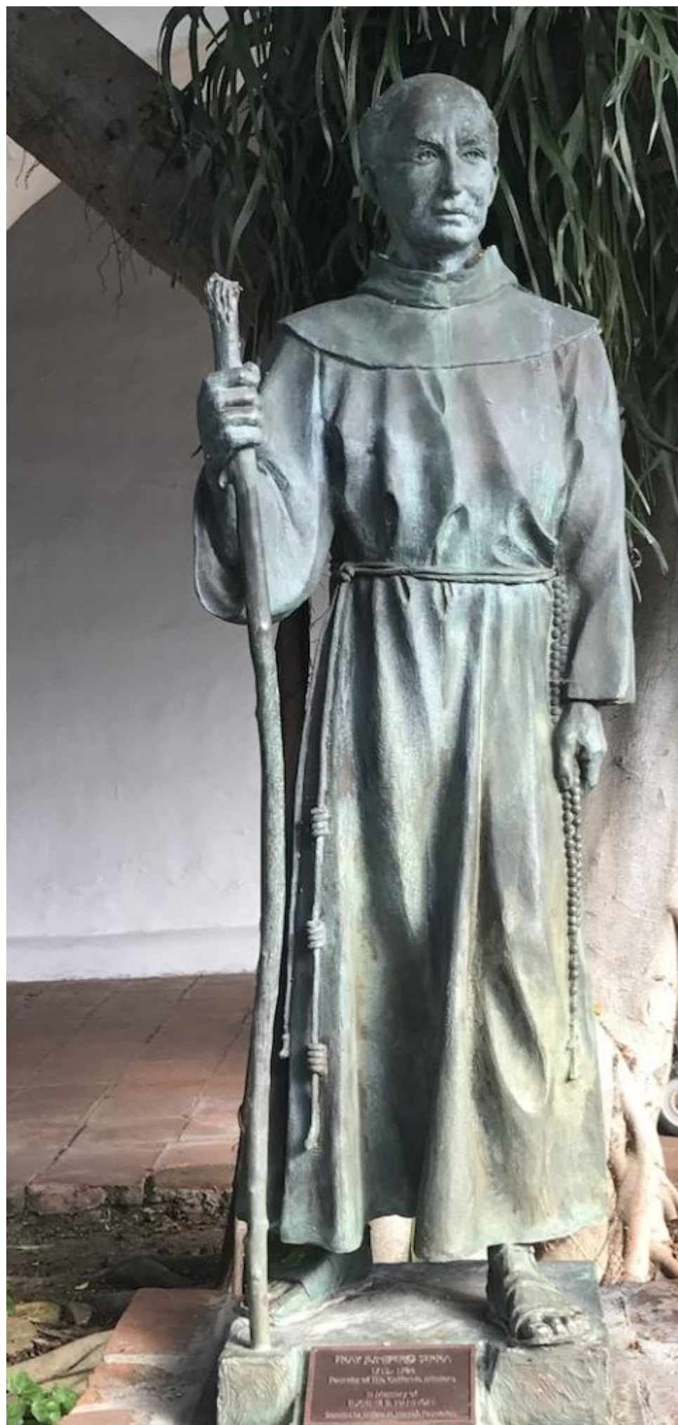
FRAY JACINTO SERRA 1713-1789 Franciscan friar, missionary in the history of California and the United States San Francisco, California, United States