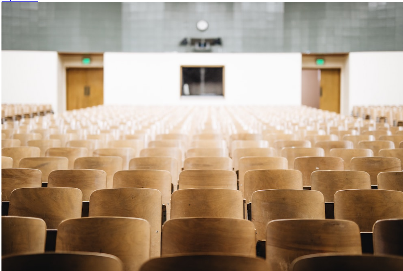
An empty lecture hall