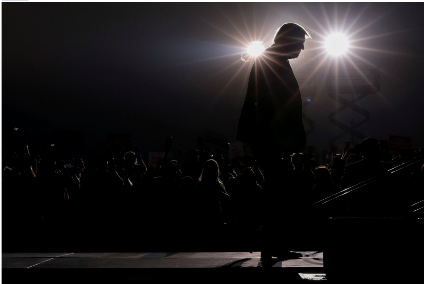
President Donald Trump is seen at a campaign rally in Reno, Nevada, Sept. 12.