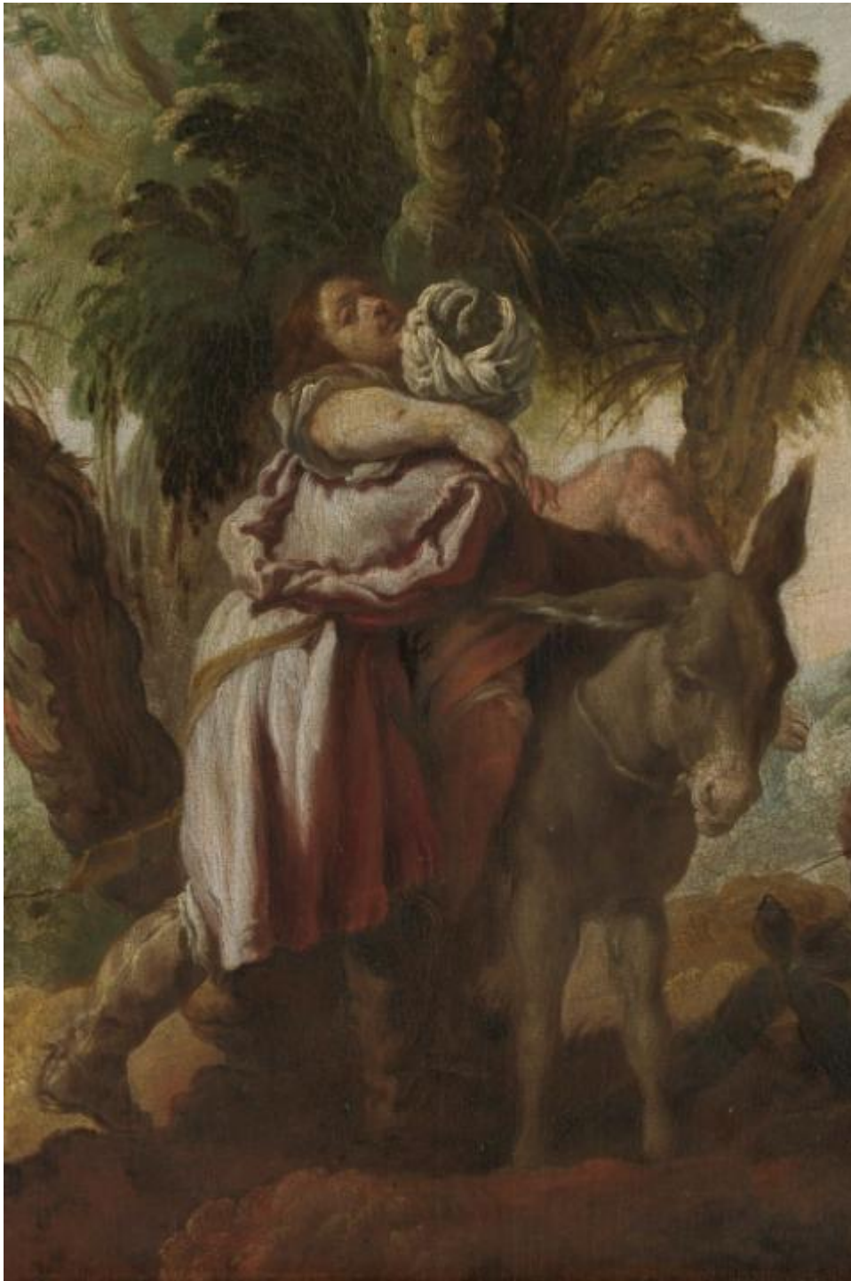
"The Good Samaritan" (circa 1618-22, detail), attributed to Domenico Fetti (Metropolitan Museum of Art)

The parable of the good Samaritan provides an alternative. It lays out clear, positive moral obligations to our neighbor, including those who, in one way or another, are