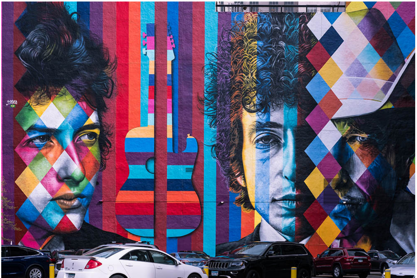
A mural of Bob Dylan in Minneapolis, Minnesota

In the early pages of New Seeds of Contemplation , Merton writes that "contemplation is always beyond our own knowledge, beyond our own light, beyond systems, beyond explanations, beyond discourse, beyond dialogue, beyond our own self. To enter into the realm of contemplation one must in a certain sense die : but this death is in fact the entrance into a higher life. It is a death for the sake of life , which leaves behind all that we can know or treasure as life, as thought, as experience, as joy, as being" (emphasis mine).