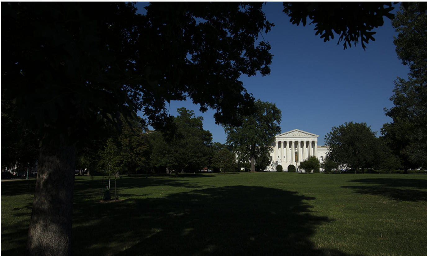
The U.S. Supreme Court in Washington, D.C.