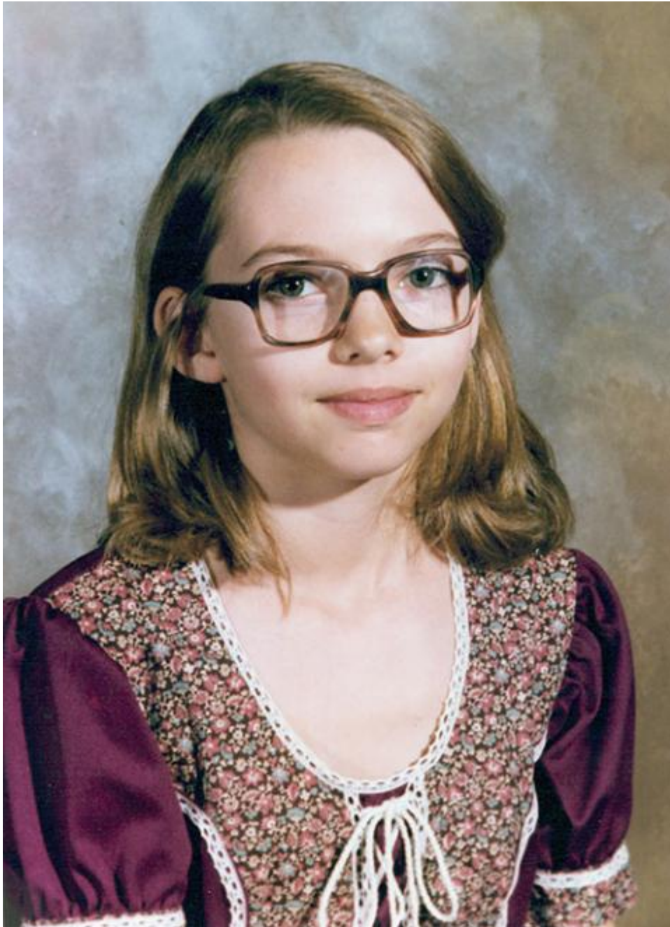
Lisa Montgomery, at the age when her stepfather began raping her

Montgomery was born with brain damage from her mother's drinking; the mother brutally beat all her children and began prostituting Montgomery in her early teens. At times, Montgomery was raped by several men, one after the other, for hours on end. As a consequence of years of sexual torture, she began to disassociate from reality and developed post-traumatic stress disorder. Her school noticed that when she did come to class, she was filthy and dressed in ripped and tattered clothing.