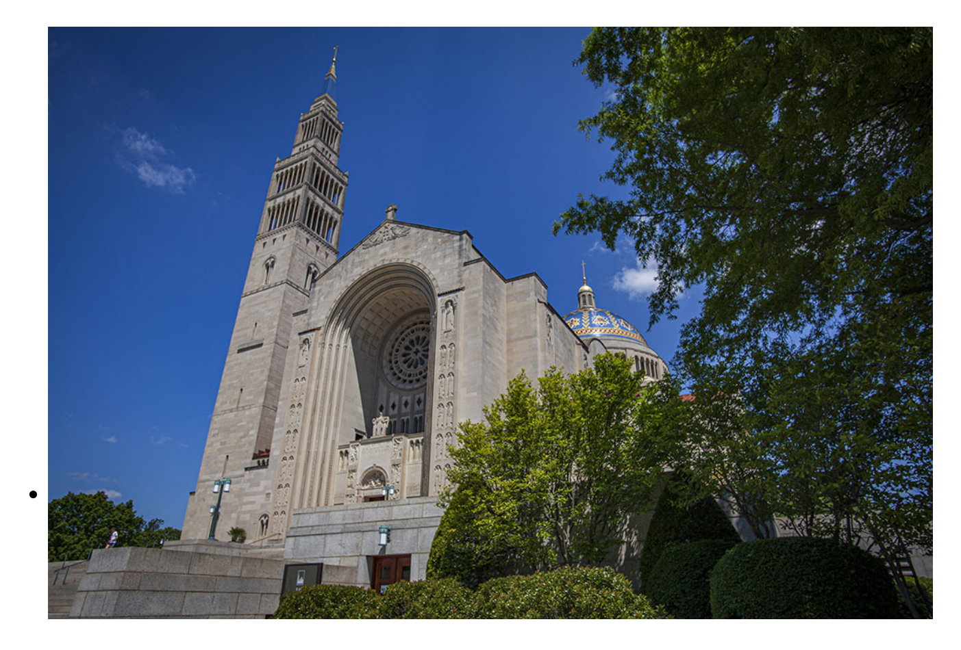
The Basilica of the National Shrine of the Immaculate Conception in Washington is seen in mid-May 2020.