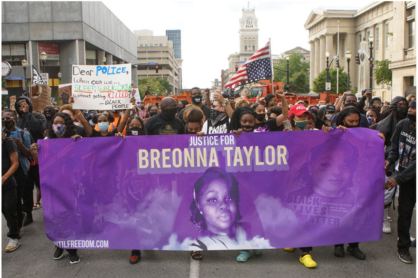
Demonstrators in Louisville, Kentucky, march for Breonna Taylor Sept. 25.