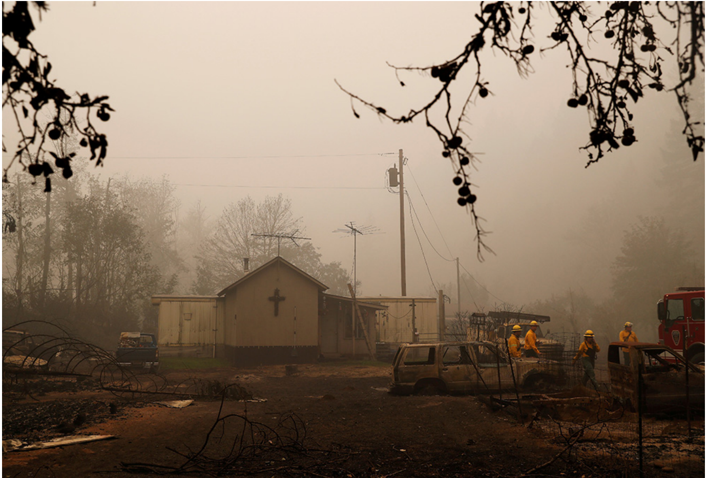
Firefighters in Detroit, Oregon, assess wildfire damage to a church Sept. 14, 2020, in the aftermath of the Beachie Creek Fire.