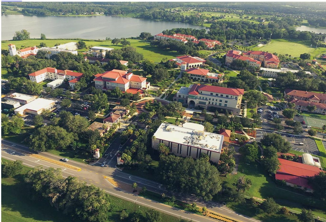
A 2017 aerial view of the main campus of St. Leo University in St. Leo, Florida