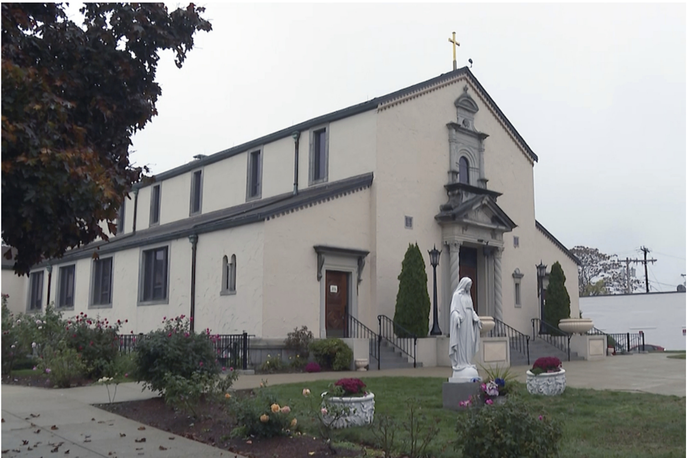
The St. Francis of Assisi School in Braintree, Massachusetts on Oct. 28, 2020.

The archdiocese, along with its parishes and schools, collected more than $26 million in paycheck money. New Orleans Archdiocesan officials didn't respond to written questions.