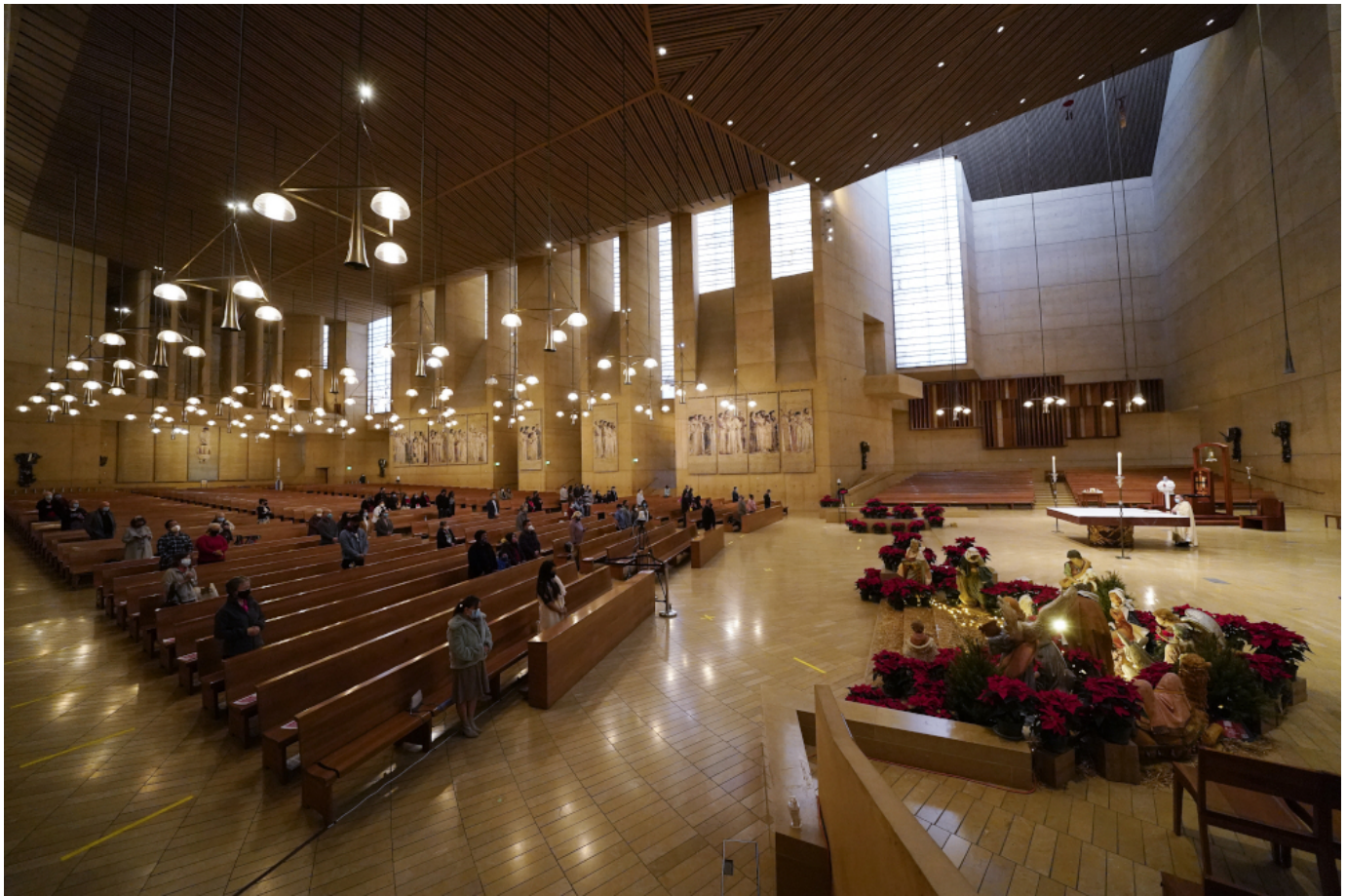
In this Dec 24, 2020, file photo, worshippers gather for Christmas Eve Mass at the Cathedral of Our Lady of the Angels in Los Angeles.

While some Catholic officials insisted their affiliates are separate and financially independent, AP found many instances of borrowing and spending among them when dioceses were faced with prior cash crunches. In Philadelphia, for example, the archdiocese received at least $18 million from three affiliates, including a seminary, to fund a compensation program for clergy sex abuse survivors, according to 2019 financial statements.