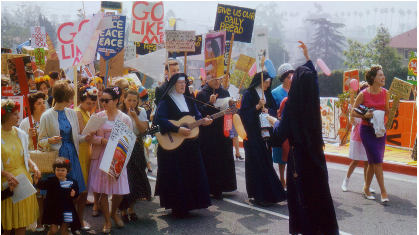
Immaculate Heart College Mary's Day celebration, 1964, seen in a still from the documentary "Rebel Hearts"

The film presents the tension that arose between the sisters and McIntyre. He was unwilling to dialogue with the sisters and this complicated much of their ministry during this time. The archbishop criticized the sisters, who like many other religious orders, were adapting to the changes of the time. They experimented with their religious habits, lifestyles (think schedules), and ministries.