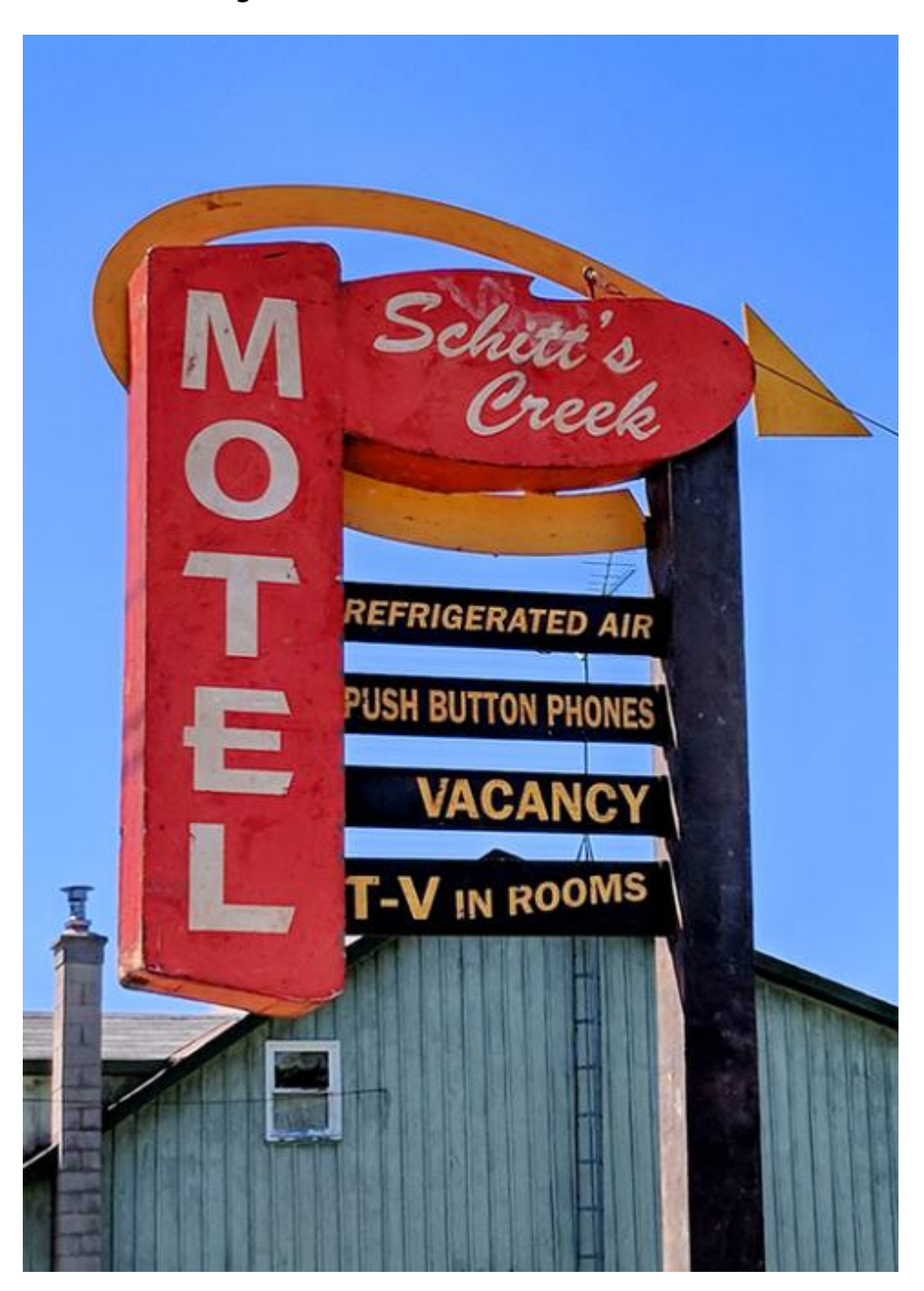
The Schitt's Creek Motel sign as featured in the television series

entrepreneurial path for herself at the local college. We leave her in the finale on the brink of striking out on her own into the world of PR in New York City.