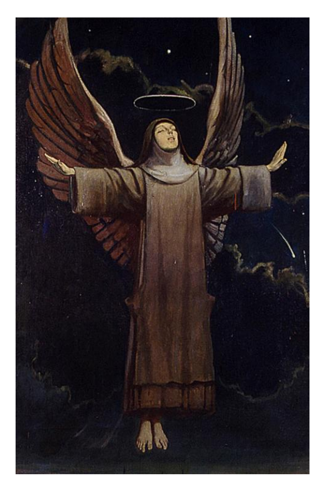
A painting in a church depicts St. Christina the Astonishing.

After having a vision of the souls suffering in purgatory, God gave her the option to go straight to heaven or to continue living a life of penance for the souls in purgatory. She chose to stay on earth.