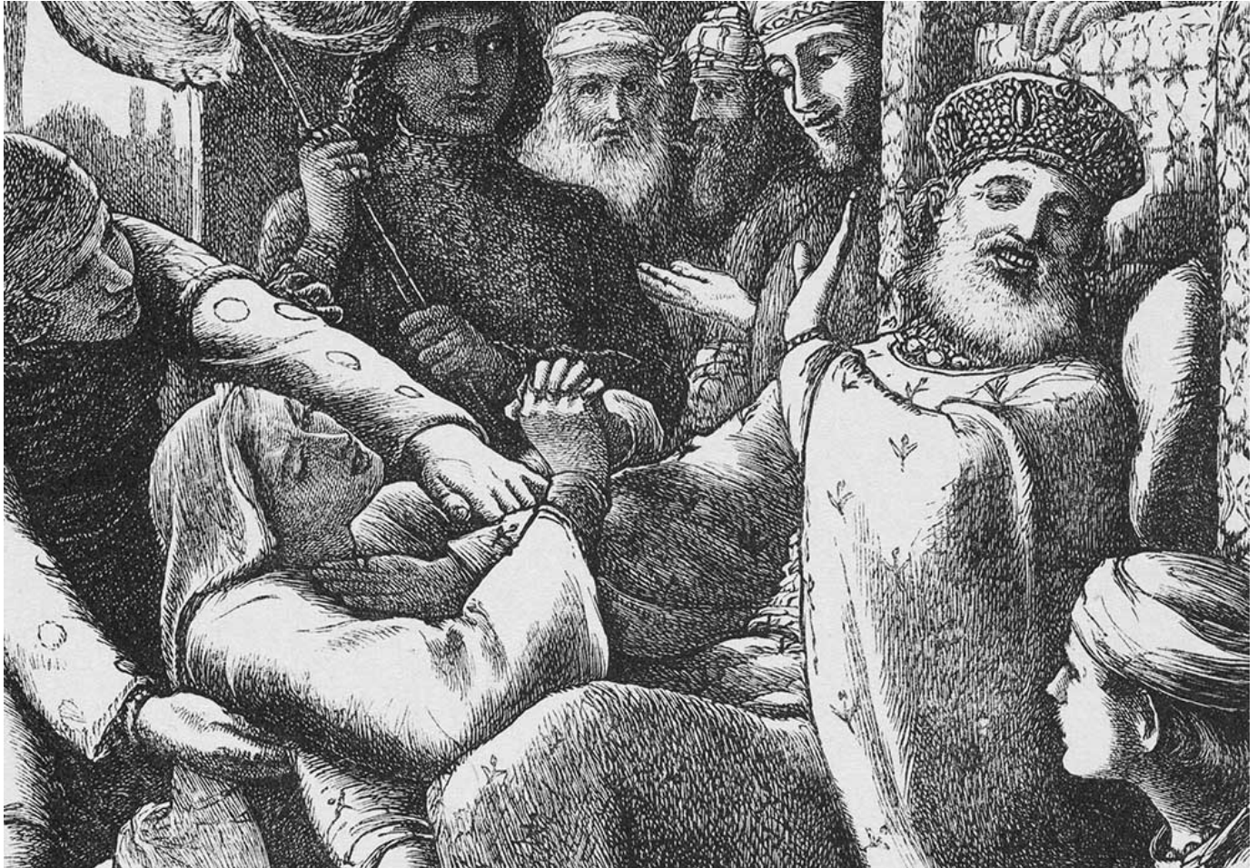
Detail from "The Unjust Judge and the Importunate Widow" (1864), created by John Everett Millais, engraved and printed by the Dalziel Brothers (Metropolitan Museum of Art)