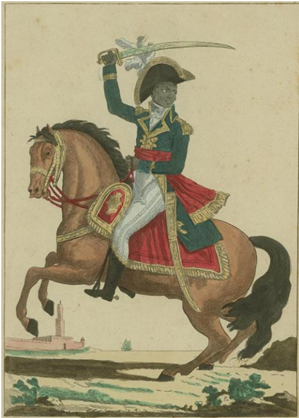
A circa-1800 engraving of Toussaint Louverture, part of a series of portraits of generals of the French Revolution (Wikimedia Commons/John Carter Brown Library)

A devout Catholic, Toussaint surrounded himself with priests who helped him craft a constitution in 1801. In it, he reaffirmed St. Domingue as a colony of France, reinstituted the plantation economy, made Catholicism the state religion and placed former white slave overseers as managers on some of the rebuilt plantations. Moreover, he restricted the movement of African workers so they could not leave the plantations during the week without permission from the overseers.