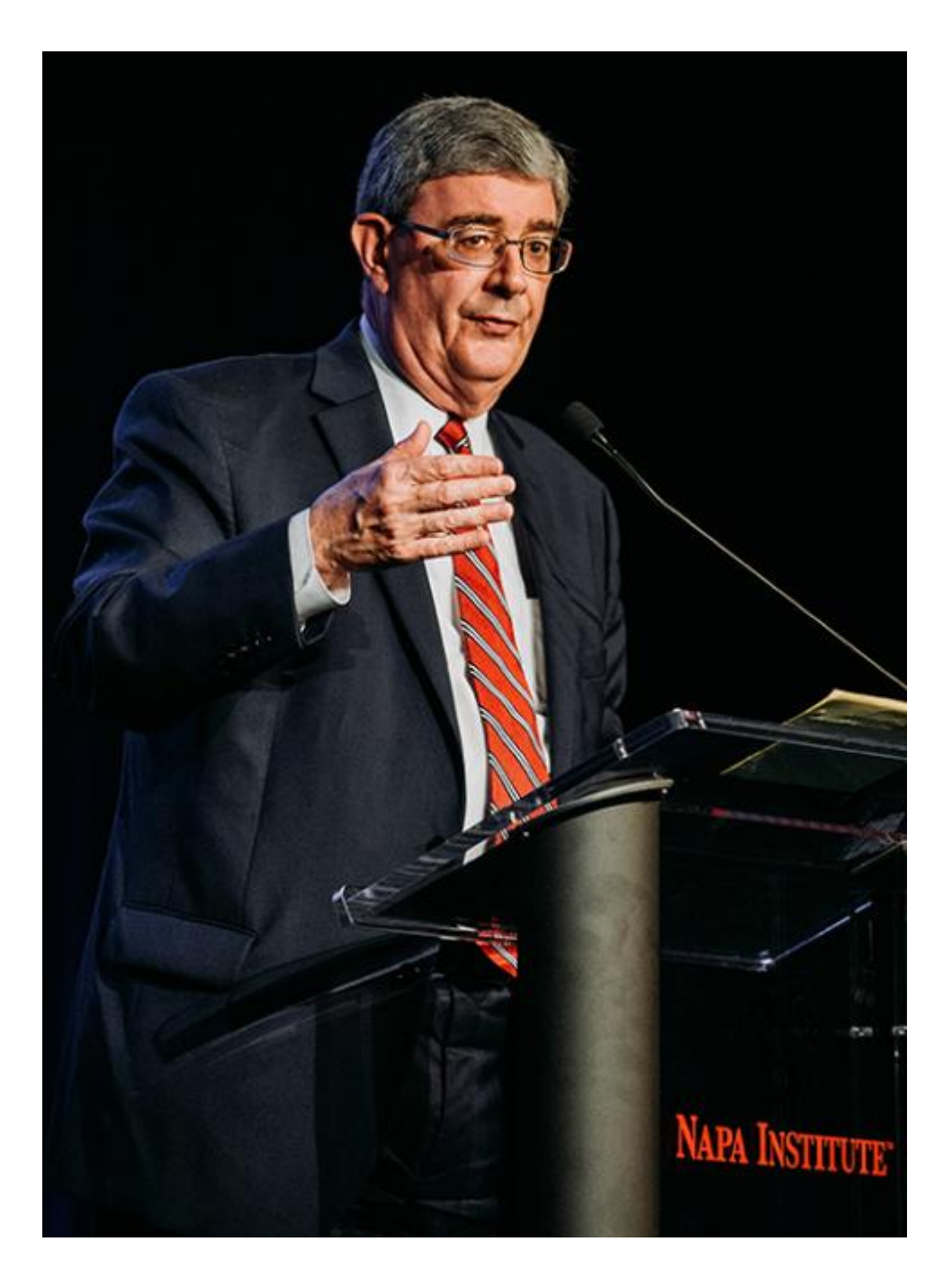
George Weigel speaks July 25, 2019, at the Napa Institute's annual Summer Conference in California.

In the pontificate of Benedict XVI, the cracks in these claims to be official interpreters of Rome for the U.S. church became harder to maintain, especially after Weigel's embarrassing <u>dissembling</u> of Benedict's encyclical <u>Caritas in Veritate</u>. Weigel claimed to be able to mark out the authentic passages of the document with his gold pen, while running a red pen through the sections he attributed to the Vatican bureaucracy.