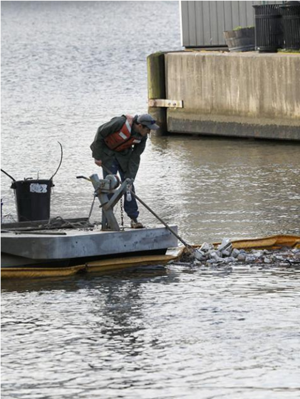
A worker collects trash in a containment along Baltimore's Inner Harbor June 11, 2019.