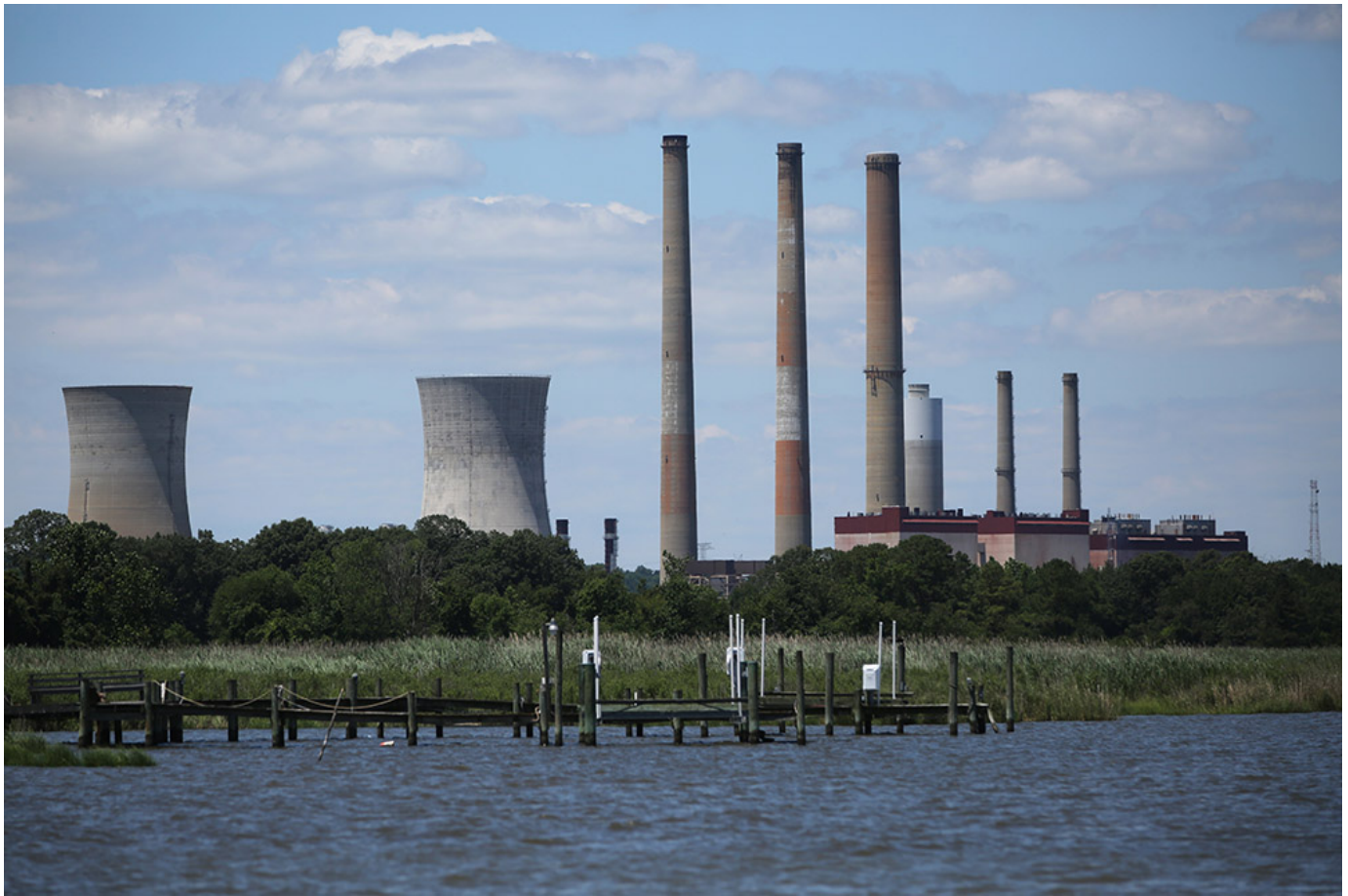
The Chalk Point Generating Station is pictured along the Patuxent River in Eagle Harbor, Maryland, June 24, 2020.