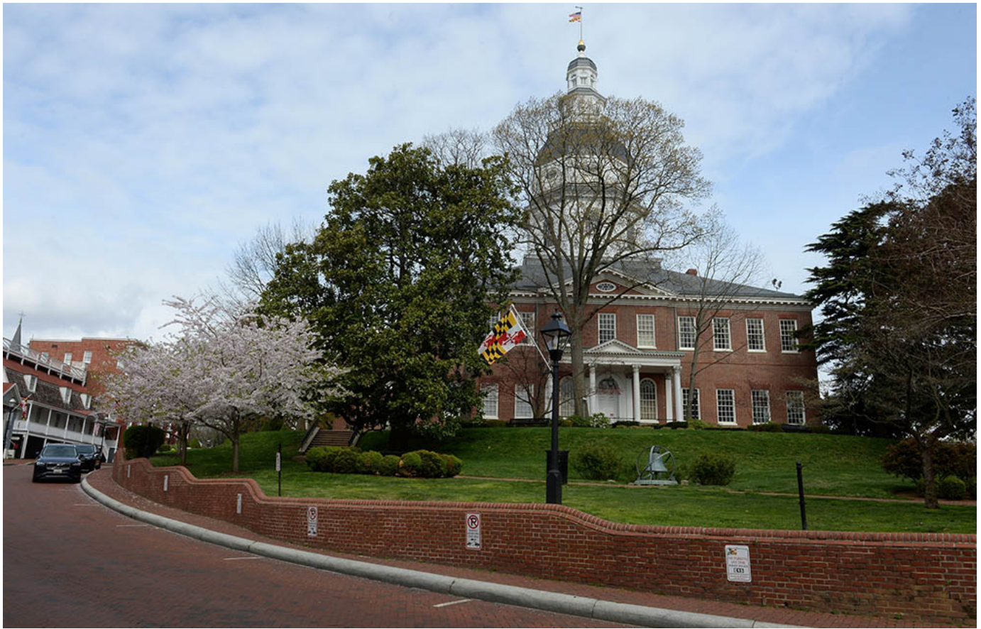
The Maryland State House is seen in Annapolis March 31, 2020.

The Maryland League of Conservation Voters called the Climate Solutions Now Act "a historic breakthrough" after a similar bill failed last year and said that overall "the session may be remembered as one of the most successful and momentous in decades."