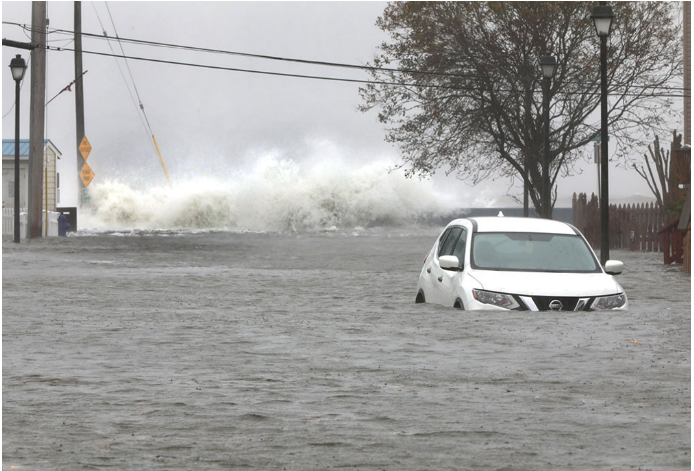
Waves crash over rocks near a submerged vehicle along Maryland's Chesapeake Bay during a Nor'easter in North Beach Oct. 29, 2021.