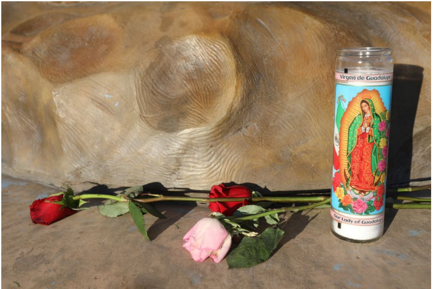
A candle and roses are pictured outside the Sanctuary of Our Lady of Guadalupe in Santa Fe, N.M., May 20, 2021.