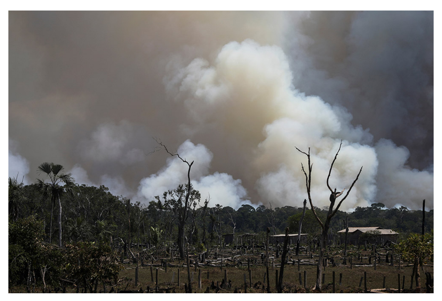
Smoke from burning vegetation rises in the Brazilian Amazon rainforest in Humaita Sept. 8, 2021.

Those figures alone demonstrate that the environment may be comparatively less important for Brazilians during elections but not as a whole — which may be a scenario generated by the history of the electoral dynamics in the country. Still, the survey shows that preservation is not out of voters' minds.