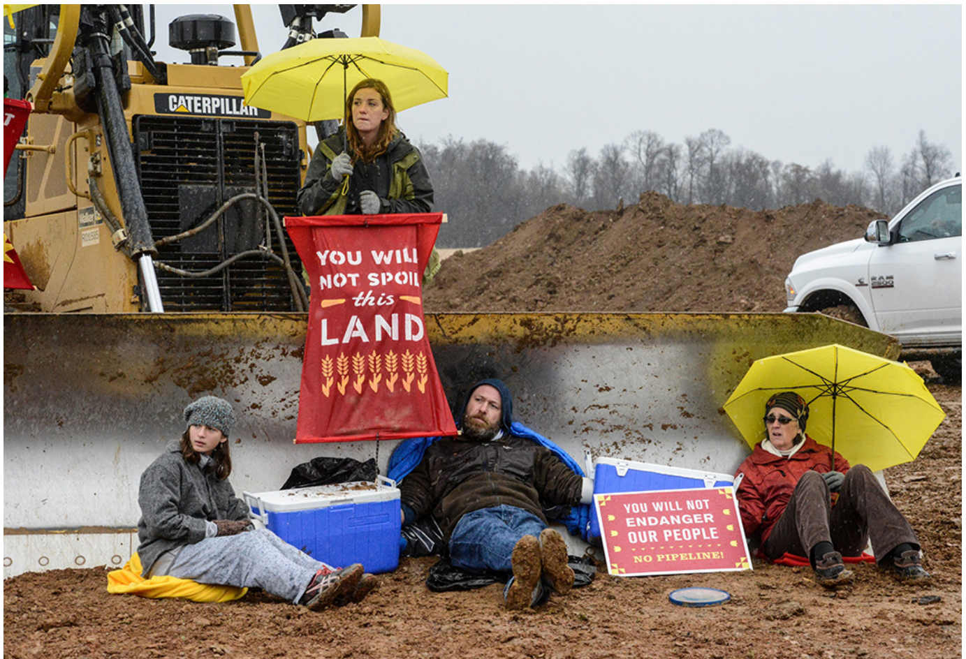
Activists with Lancaster Against Pipelines block construction of a pipeline Nov. 18, 2017, in Holtwood, Pennsylvania.