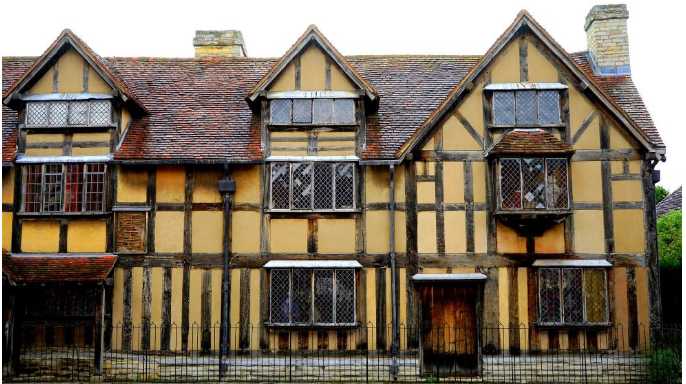
Childhood home of William Shakespeare in Stratford-upon-Avon, England

Even the book's cover art underscores that theme with a stained-glass window depicting Joseph of Arimathea planting his staff in England. The title references Frederick William Faber's iconic hymn .