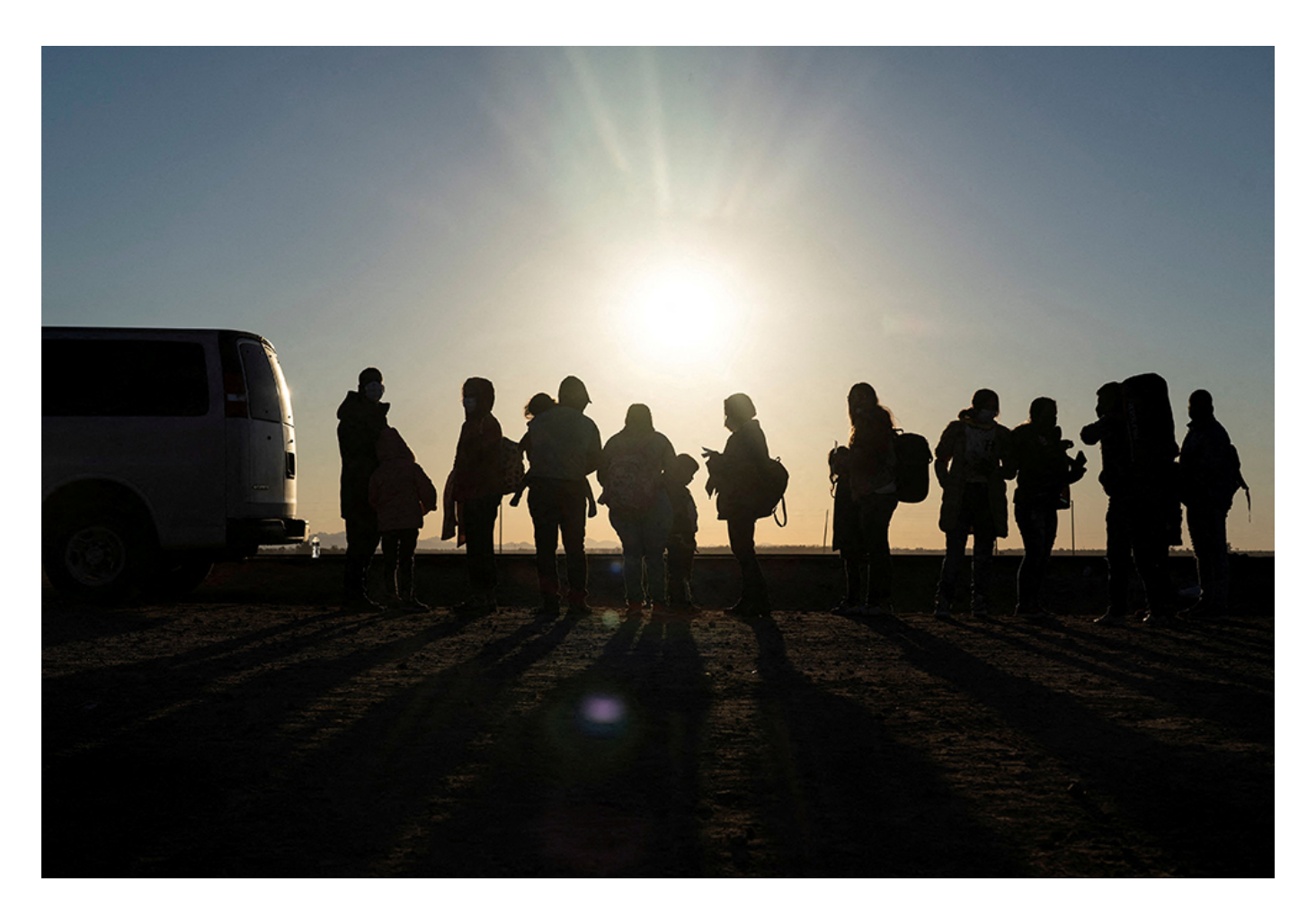
Migrants seeking asylum in the U.S. are seen in Yuma, Arizona, Jan. 23, 2022.

Second, opponents use the phrase to slow down, and even stop, any discussion about reforming the immigration system, including a legalization program for undocumented immigrants. They argue that no reforms can proceed without first "securing" the border. This concept has often been reflected in proposed immigration reform legislation.